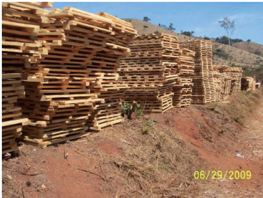
Picture 17. These wooden pallets were manufactured from the sawn wood 'rejects' under an order worth millions of Malawian Kwacha. The timber enterprise that makes them also produces other sawn wood planks like the rest of the other mobile sawmills.