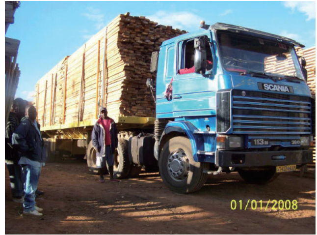
Pictures 15 and 16. Sawn wood for export warehoused at Luwinda, Mzuzu before being transported to Kenya or Tanzania.