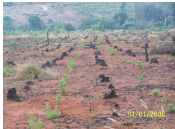
Picture 10 and 11. Nursery, establishment and tending operations that saw millers are also required to undertake as part of management agreement.