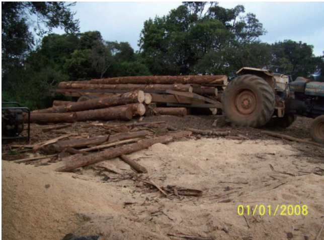
Picture 5. A tractor delivering saw logs at one of the milling sites.