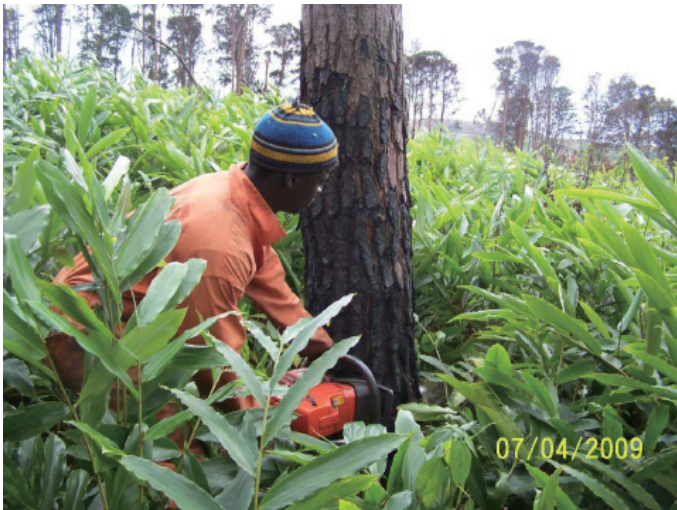
Picture 4. A tree cutter using a chainsaw

The harvesting system used is the clear felling system with saw logs either transported to a milling site or sawn directly at the felling site. Those with semi-mobile sawmills transport their timber from various blocks to a central milling point, while those with readily mobile sawmills produce sawn wood within the harvesting site.