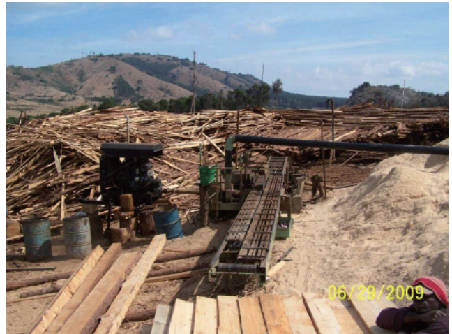
Picture 6. A KARA F2000 sawmill- one of the semi-mobile type.