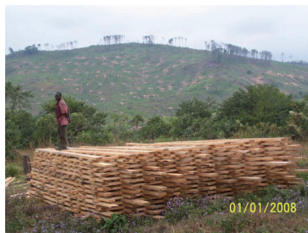
Pictures 2 and 3. Saw logs ready for sawing, and on the right, produced sawn wood