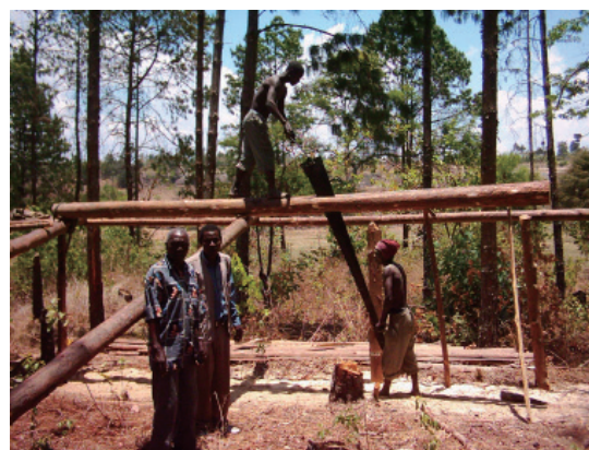
Picture 12. A pair of pit sawyers sawing a sawlog. Sometimes pit sawing is done on relatively gentle terrain.

standing volume. On the Viphya, it is done through bidding. Variations in value depend on the average volume per hectare in a particular plantation. For example, the average volume per hectare in Lusangazi plantation ranges from 250 to 350m 3 while in Nthungwa plantation volume ranges from 250 to 500m 3 .