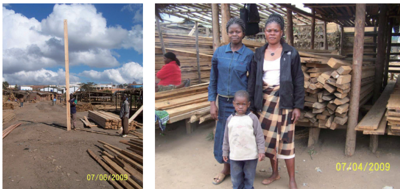
Picture 14. Business women at Mzuzu market who make up half of the total number sellers

On average, a timber seller at Mzuzu timber market expected to earn MK 455,000 (US$ 3,250) during the season.