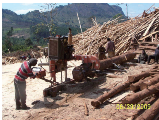
Picture 13. A WoodMizer mobile sawmill in action in Nthungwa Plantation

With the unit cost and selling prices per plank as estimated in table 3, the total expected costs for all the Lusangazi plantation mobile saw millers is estimated at MK 34.4 million (US$ 245,714), and expected earnings at MK 58.3 million (US$ 416,428) for the 2008/09 season. The total costs and earnings for all Nthungwa plantation mobile saw millers are MK 100 million (US$ 714,285) and MK 147 million (US$1,050,000),