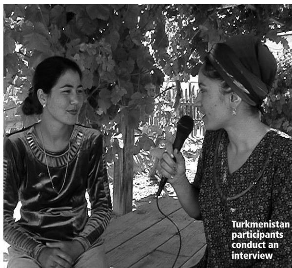
Turkmenistan participants conduct an interview

In this Insight project in Turkmenistan, community members are using video to document meetings. In this way, women, who traditionally do not attend such meetings, can watch the discussions in their own homes. The women then provide feedback and suggestions, also via video, and the films are played to the community at evening screenings, ensuring that their ideas and opinions are heard.