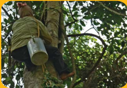
Sustainable honey collection

Revenues from the tours will contribute to the protection of this wilderness area and support the livelihoods of the community through a community fund.