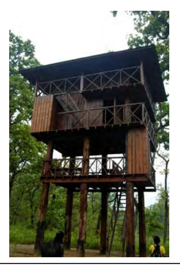
Watch Tower inside the Buffer Zone

The committee has recently started its own eco-tourism project inside the buffer zone where they have built a tourist watch/sleeping tower. Some of their conservation activities include building water holes in the buffer zones to provide more water for the animals during dry season. Most of their projects are being funded from tourism income and some by donors or individuals who were inspired by their accomplishments. There is also emergency fund for victims of human-wildlife conflict. Each VDC has their own specific project to complete.