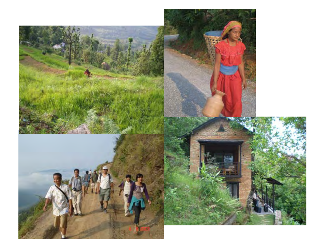
From top to bottom clockwise: A villager cutting grass for cattle in the communal grazing area inside the community forest. A Nepalese woman on her way to fetch water from a pump funded by Pokahara Lodge Management. Rooms designed as a typical Gurung house situated around the hilltop offering breathtaking views of the area. The team experiencing a guided walk from the lodge to Pohkara town getting an overview of community life along the way;