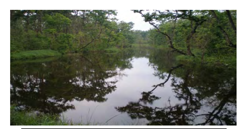
Water hole built by the user group committee to ensure availability of water for wildlife especially during dry season