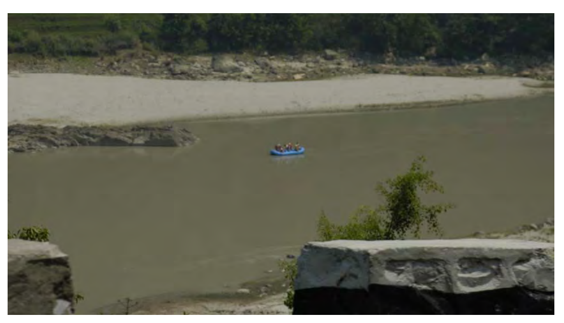
A river rafting expedition seen during our bus trip, this is a relatively new tourist activity promoted by the NTB and has strong local participation in the form of guides and owners of rafting operations.