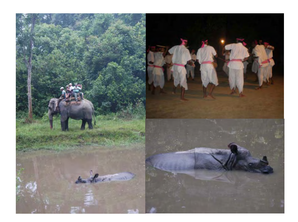
Day 6-7 Gaida: Two day stay at Gaida Wildlife Lodge in Chitwan National Park and meeting with the Village Development Committee which is managing a buffer zone of the park.

This section of the tour was a highlight for all the participants, the team visited the Sauhara tourist area located on the edge of the Chitwan National Park.