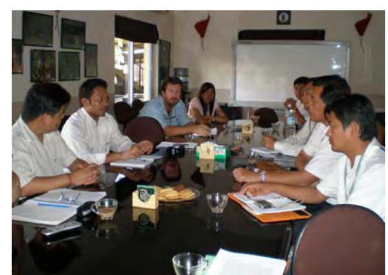
Briefing at WWF Nepal Office