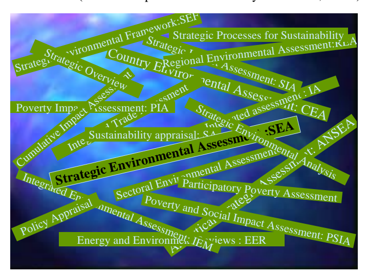
Figure 2.1: The menagerie of SEA terminology