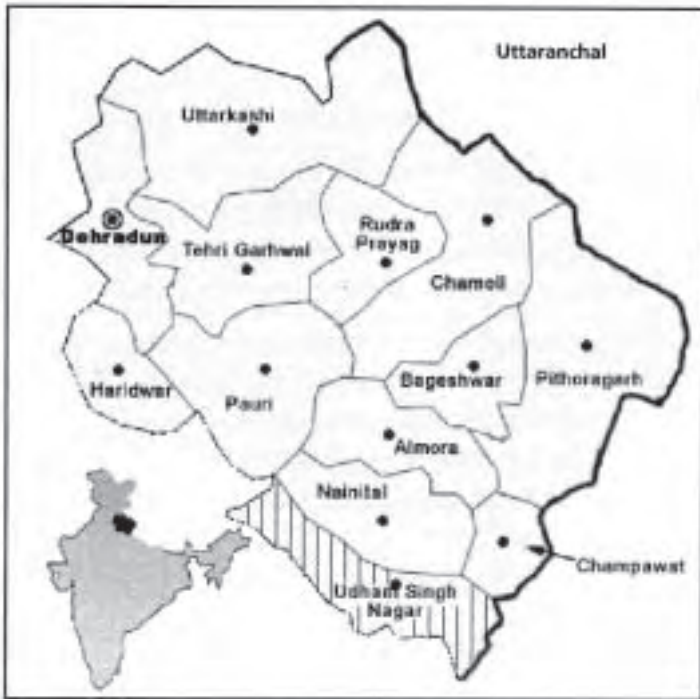
Figure 1 Location Map of Uddham Singh Nagar District