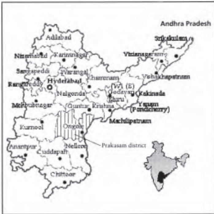
Figure 2. Location Map of Prakasam District