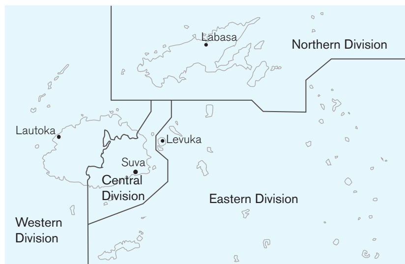
Figure 2. Fiji political boundaries