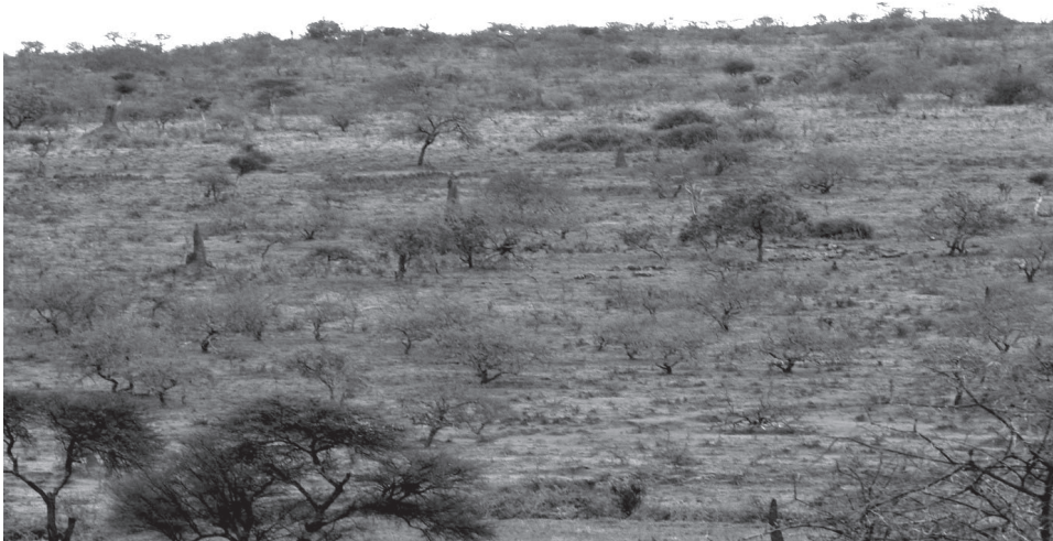
FIGURE 3. LAND DEGRADATION IN THE BORENA RANGELANDS.

Conflict over grazing and watering resources and boundary claims have become a major livelihood challenge for pastoral communities. Some areas, such as in the Wachille and Surupa areas in Borena rangelands, have been abandoned in fear of conflicts, resulting in the underuse of available resources. A solution has to be found for defusing the growing conflict between Karrayu and Argoba , Karrayu and Afar , and between Borana and Guji , Borana and Gari communities. Alternative dispute resolution mechanisms need to be strengthened and customary institutions that regulate access and use of communal resources need to be empowered.