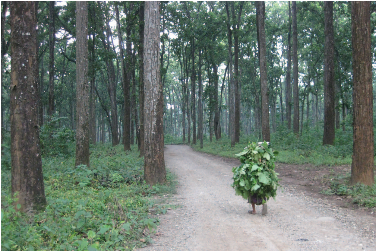
A woman carrying fodder for stall feeding in Nepal, 2009

Finally, there is a tendency to talk about gender aspects of climate change as if women are only victims. Many studies show that women have been instrumental in organising themselves and others around environmental issues and sustainable development (Dankelman, 2002). Policies and programmes to address climate change need to harness women's unique knowledge and ability to act as powerful agents of change.