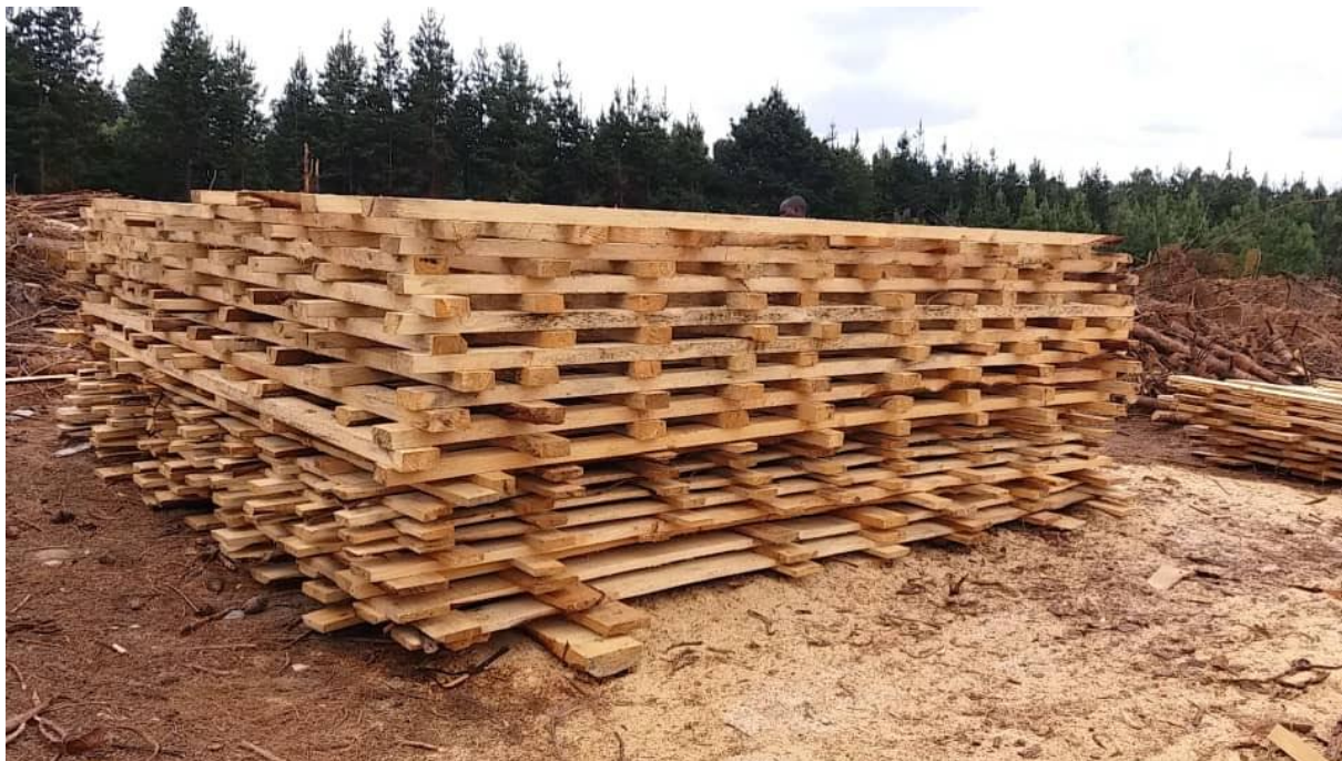
Fig 1: TTGAU member's wood being processed for value addition at Iboya village

Smallholders account for 54% of planted area in Tanzania. However, this potential is not reflected in their market share because their woods are characterised by poor productivity and quality. Furthermore, technology used to process wood from smallholders is inefficient leading to low volumes and poor quality, thus low returns. Together with providing technical advice on good silvicultural practices, TTGAU is supporting members to process wood using improved technology to improve quality and increase their income.