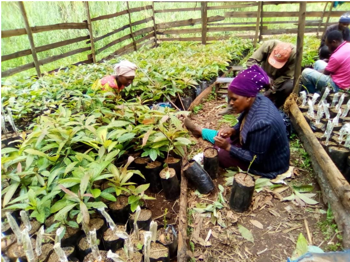
Fig 3: TGA members grafting avocado seedlings

TTGAU is supporting members with commercial beekeeping practices by providing technical support on various matters pertaining to production, processing and marketing of honey and related products. To accumulate capital to invest in avocado farming and beekeeping, TTGAU is supporting TGA members to establish village savings and lending associations (VSLAs). These VSLAs can then offer loans to help farmers acquire planting stock or beehives.