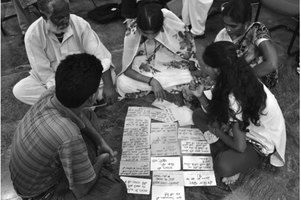
Ground-level panel participants collectively reviewed the recommendations and agreed 15 overarching action-oriented goals.

deliberate on the United Nations high-level panel recommendations for the post-2015 development agenda. The panellists, who experience poverty daily, used a participatory process to collectively review the recommendations, agreeing 15 overarching action-oriented goals: