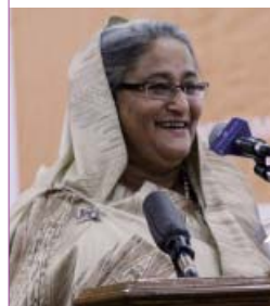
Sheikh Hasina, Prime Minister of Bangladesh

Sheikh Hasina, Prime Minister of Bangladesh, stressed that poor communities are in the forefront of climate change adaptation and applauded the participants' efforts to provide governments, scientific communities and non-governmental organizations (NGOs) with guidance.