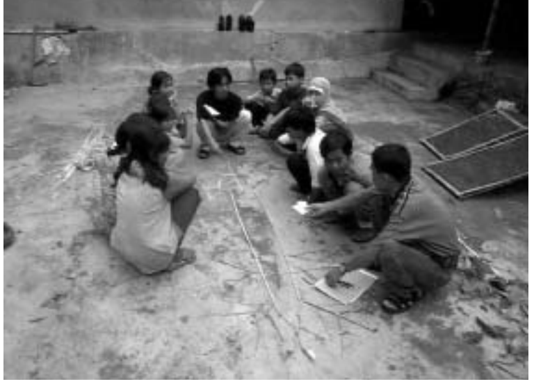
Children in Indonesia discussing their cause-effect flow diagram, presented as a tree made with local materials. The trunk represents the issue, the roots the causes and the branches the effects.

The CCCDA process in Surabaya, eastern Java has already yielded tangible benefits for children. During discussions with children it was revealed that they were unable to attend non-formal education classes because of competing demands on their time, as parents require their children to collect water. Staff facilitated negotiations between children and parents, with the result that parents no longer insist that children collect water when classes are being held.