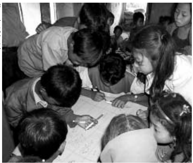
Children in Nepal using drawing to explore issues around the different types of work they do

Many participatory evaluation methods were tried and tested in the field by the team. These include evaluation matrices, ranking, mapping, time-trends and flow diagrams, and looking at the participation of different stakeholders at different stages of a project cycle. More details of these approaches are given in the project document.<sup>2</sup>