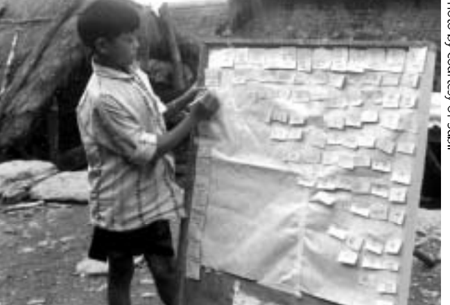
Boy in Nepal using pairwise ranking to prioritise issues

The mapping process in South Africa involved a range of community-based organisations (CBOs), national and international non-governmental organisations (NGOs) and networks, government departments and commissions. Detailed case studies have been included to show how to build capacity, measure impact in different sectors and give guidance on methods and approaches. In Nepal, for example, a case study with the Himalayan Community Development Forum (HICODEF) has documented why it is important to monitor the impact on children's lives of development projects and how this can be done in the future. In collaboration with the authors, HICODEF staff have used participatory approaches with different stakeholders in three villages in the Nawalparassi area in the Mahabarat Mountains to evaluate their programmes.