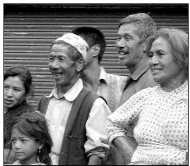
Figure 2 Popular communications comes from people's own culture

The Well of Inspiration is a testament to individuals who have dedicated their commitment and creativity to democratic transformation. It brings together different realities; expressions of anger and hope. In this edition of PLA Notes, we bring you a taste of these stories, a first draught from the 'Well'. The stories take different forms: radio scripts, testimonies, anecdotes. They speak on different levels and across different dimensions of communication. For this reason, because of their diversity, the stories can be useful to us on many different levels; from practical examples of how to do something (like a radio phone-in) to providing pointers for thinking more deeply about why we do what we do, and what we really want to achieve, beyond getting through a day's work or meeting a project deadline. Some stories can be read as cautionary tales, 'don't embark on something like this without first taking into account...'; others encourage perseverance, 'if something like this happens to you, don't give up...'. Because they are stories of lived experiences, they are woven through and through with personal insight, reflection, revelation and emotion. They are stories by and for activists, spoken from the heart with courage, brimming with feeling and with the awareness that comes from reflecting on experience. As such, they offer a window through which to gain a glimpse into that experience - rather than a kit bag of popular communications techniques to borrow from.