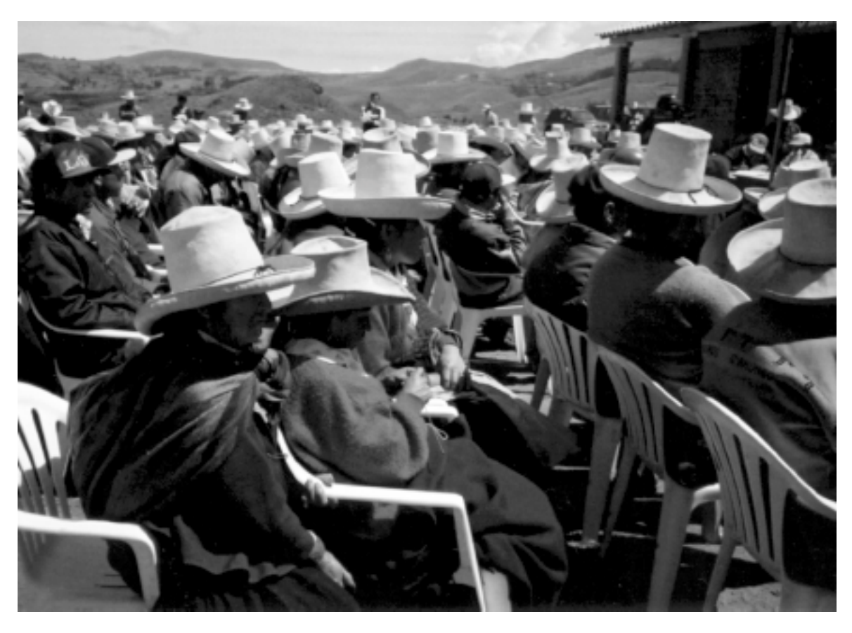
CAPACITY BUILDING: When a capacity building program is planned, how can we determine that it is not simply consultation or public relations by another name?

CoDevelopment Canada has also run capacity building programs with Minera Yanacocha company staff to strengthen skills in community consultation and negotiation. Minera Yanacocha is a partner of the Denver based company, Newmont Inc. After a 151 kg mercury spill in northern Peru, CoDev Canada partnered with a local grassroots organization to respond to community needs with training, capacity building, community healing activities, and company training to respond to community needs and negotiate with community leaders.