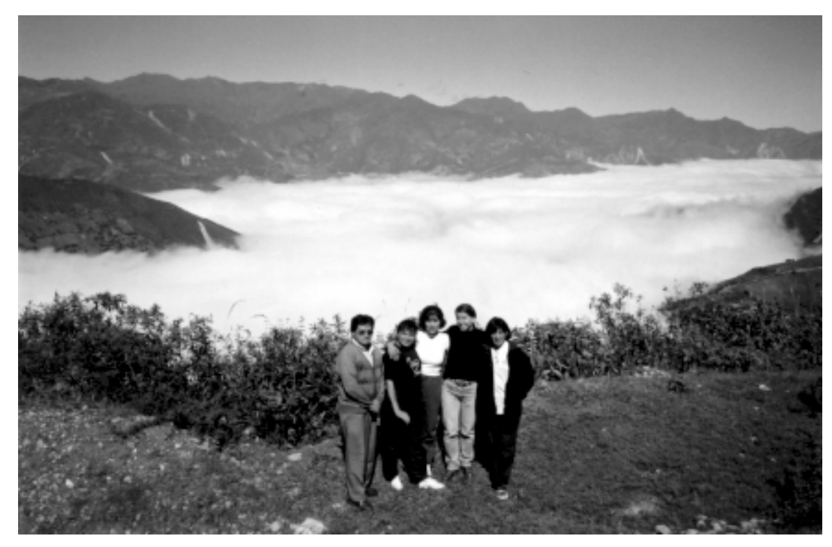
DIVERSITY OF SKILLS: Facilitators in Peru's project included a range of professionals – an obstetrician, a nurse, a psychologist, an anthropologist and a community planner – pictured here on their way to a community meeting in Choropampa.

the marginalization typical to the Andean region, which is reflected in the manner by which women are omitted from decision-making in the community.