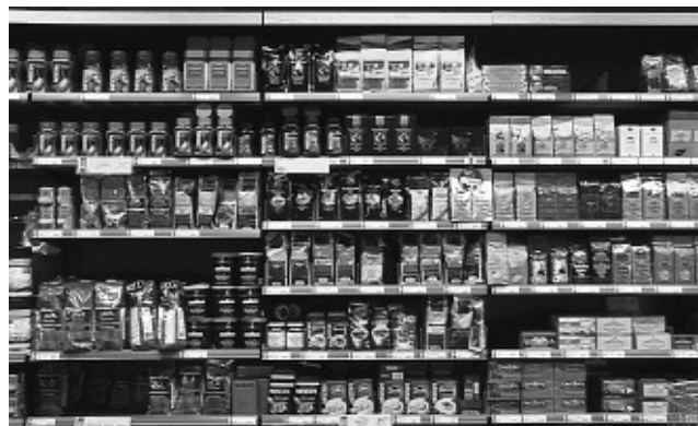
Certified coffees on retailer's shelves

The other major development in these three markets which may lead to consumer confusion is the entry of the major roasting companies into Fairtrade as discussed previously. Procter and Gamble and Sara Lee are both marketing Fairtrade coffee in the US. In Finland, the Swedish company Arvid Nordqvist has recently launched a Fairtrade coffee, 'Classic Reko,' at the very competitive price of 7 euros per kilo. It has made a Finnish blend to meet Finnish taste demands.