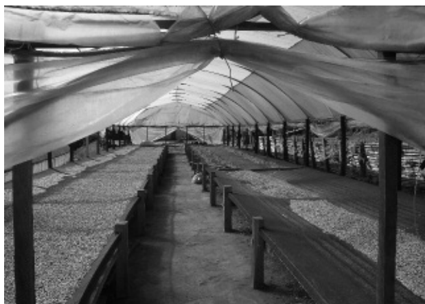
Drying sheds at Fazenda Santa Terezinha, Minas Gerais, Brazil (see page 49)