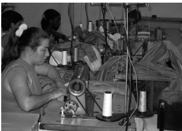
Social project at Ipemena Coffees, Minas Gerais, Brazil (see page 50)

Smallholder coffee farmers in Huehuetenango, one of the poorest areas of Guatemala, experienced yield increases of 38-67% in five years, from 0.86 to 1.40 tonnes per hectare, after converting to organic. Other coffee farmers shifting to organic in Guatemala had usually experienced reductions in yield. The difference in this case reflected low inputs and low yields before conversion as well as better shade and application of organic fertilisers and soil conservation measures. 103 Production costs increased because of the need for more labour but after initial quality problems, prices increased by 25%. Average family income increased from US$ 1,250 per year to US$ 1,970 per year. 104