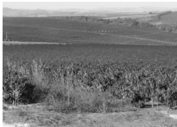
Minas Gerais coffee fields, Brazil

Coffee tends to be grown in high biodiversity areas and areas of natural forest. The destruction of the Atlantic forest in Brazil in the 19th century owes much to coffee 50 but deforestation to make way for