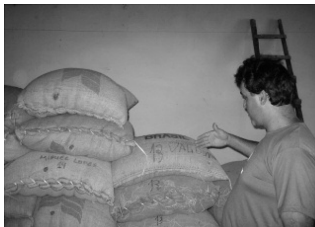
Fairtrade coffee beans in sacks, each marked with the name of the family farm, Poço Fundo association, Minas Gerais, Brazil