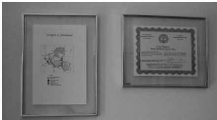
Rainforest Alliance Certificate with map showing areas under environmental control, Minas Gerais, Brazil

many more will doubtless be lost to fair trade as a whole'. The UK's Fairtrade Foundation believes that this new product will help to expand the sector by bringing new customers in rather than taking customers away from existing independent suppliers of Fairtrade coffee products such as Traidcraft and Café Direct. 109