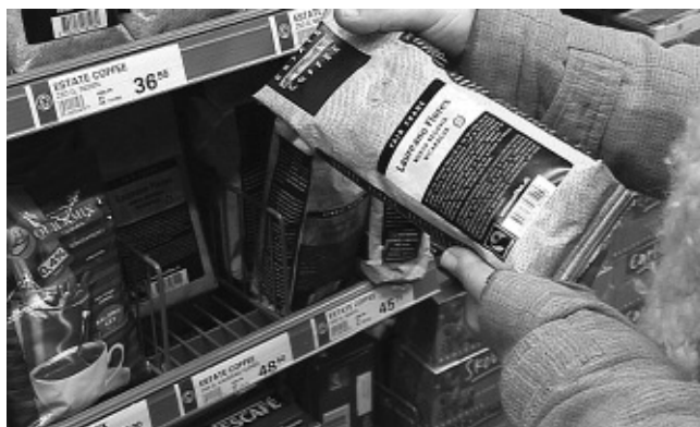
Consumer choosing a Fairtrade coffee at a retail outlet