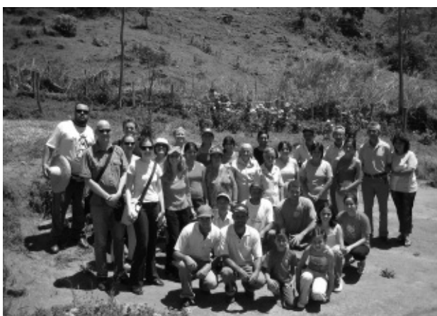
The project team and coffee farmers in Minas Gerais, October 2005

Another limitation has been the lack of information on the various links along the coffee commodity chain. A detailed representative sample survey of traders, roasters and retailers linking producers with consumers was not possible given the resources available to the study and the concerns about commercial sensitivity. We have examined three coffee commodity chains to give an idea of the different experiences and drivers in different cases. But these serve as illustrations only and cannot be used as a basis for generalisation.