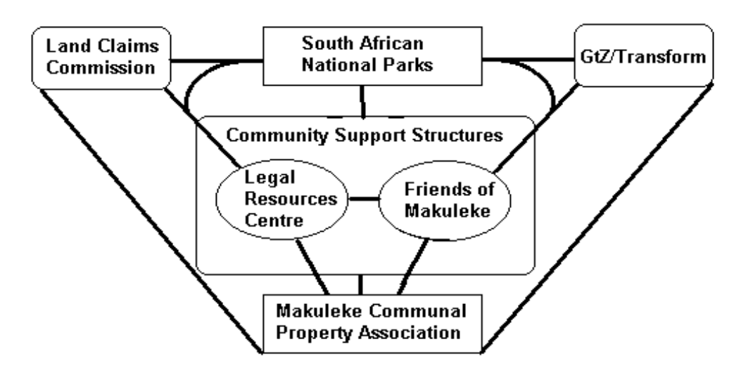
Figure 2: The Roleplayers

At Makuleke this objective was expressed in GtZ financial and technical support for the Ecotourism Project and the associated Training Project.