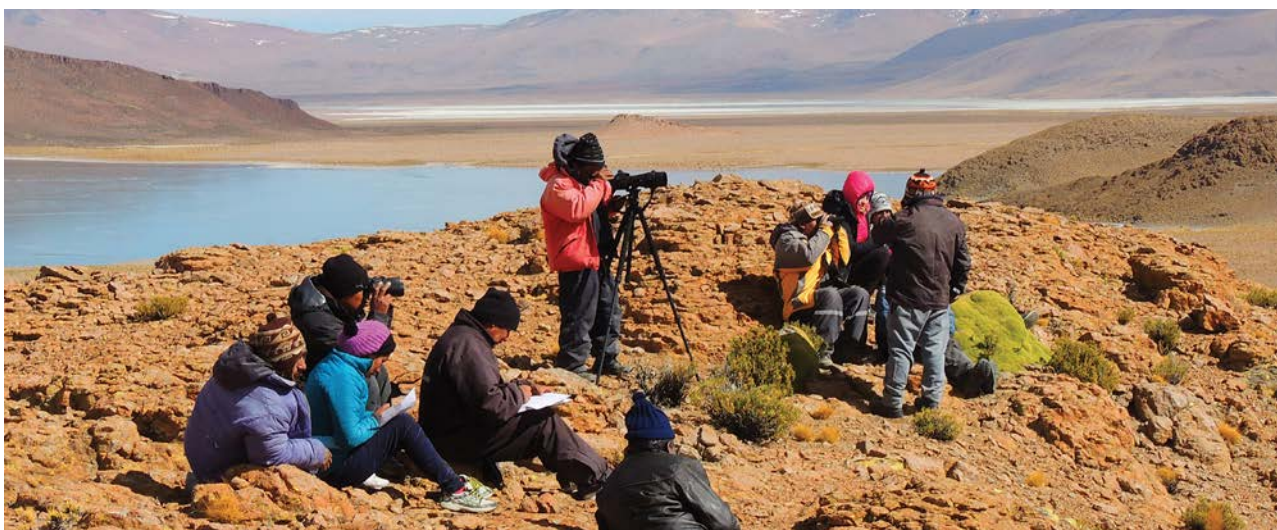
Monitoring and surveillance.