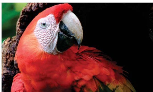
Scarlet macaw emerging from its nest in the trunk of a tree.