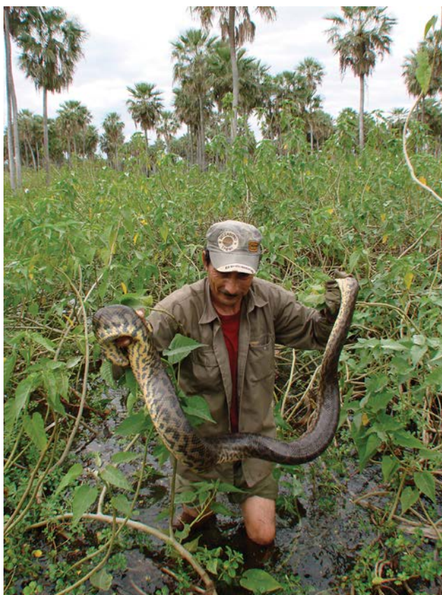
Bañado La Estrella, Formosa, Argentina.