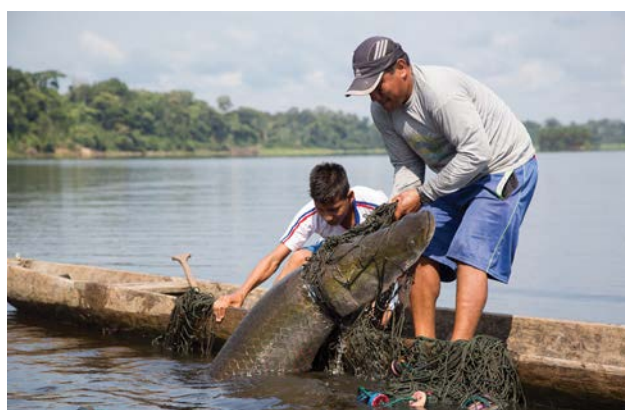
Paiche fishing.

Activities include establishing fishing quotas, minimum landing sizes and times of the year when fishing is prohibited. OSPPA Los Leones also carries out monitoring and surveillance of the arapaima.