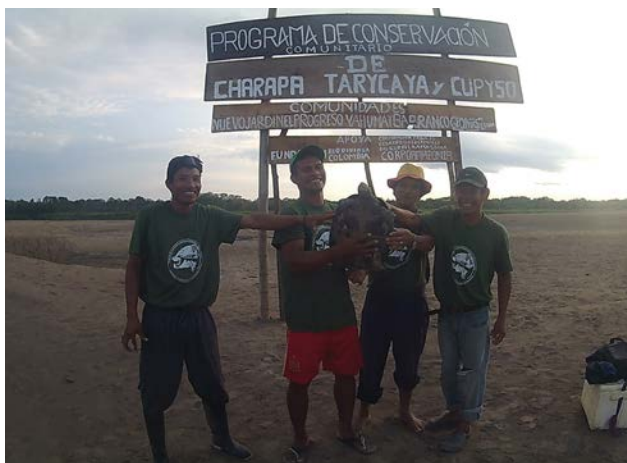
Guardians in a conservation beach with yellow-spotted turtle mother after nesting.