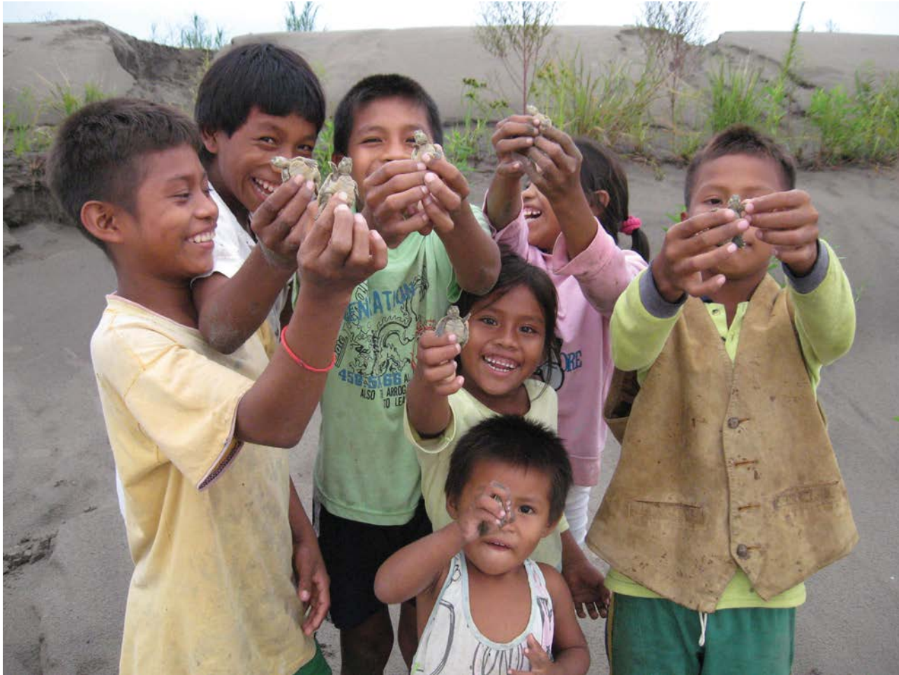
Local children symbolically adopt a hatchling.

Building trust was fundamental in reducing the stigma attached to short-term projects that lack continuity. Trust was built through transparent, concerted and tangible management of the benefits of the programme. Overall, success was achieved by giving power to communities in decision-making and the design of activities, as this ensured their participation.