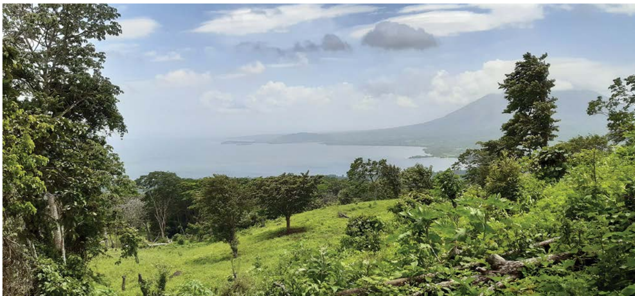
Ometepe Island.

The programme has collaborated with private farms to create an incentive scheme for protection of nests. Farmers receive goods such as machetes, hammers and nails in return for environmental stewardship. The retaliatory killing of birds due to crop raiding is not uncommon, and the programme has worked with farmers to try and reduce this threat.