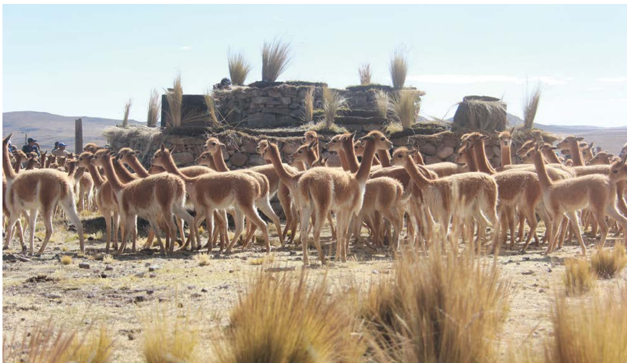
Vicuñas being penned for subsequent shearing.