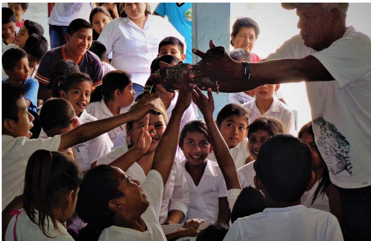
Zootropic education programme.