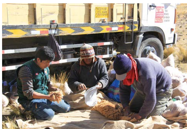
Staff of the Lucanas Rural Community and SERNANP inspecting the quality of fibre obtained by capturing and shearing wild vicuñas.

Community members capture and shear vicuñas in return for a daily wage. A rotation system ensures that all community members have access to this work and the fibre is traded in national and international markets. Alongside this, local communities are also working to develop tourism, with a view to ensuring a further source of income in addition to conservation activities.