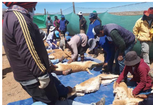
Shearing the vicuna.