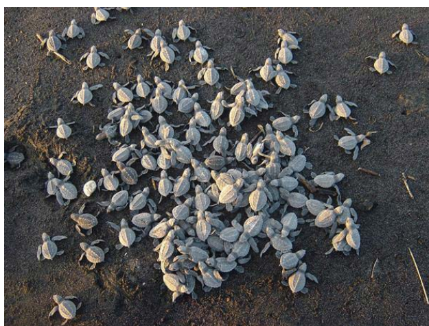
Turtle hatchlings on the beach.

In the absence of any official direction, the private sector has been more willing to contribute more to conservation. As a result of collaboration between different NGOs and the private sector, the number of turtle eggs rescued on a national level has risen dramatically from 60,000 in 2003 to almost 270,000 today.