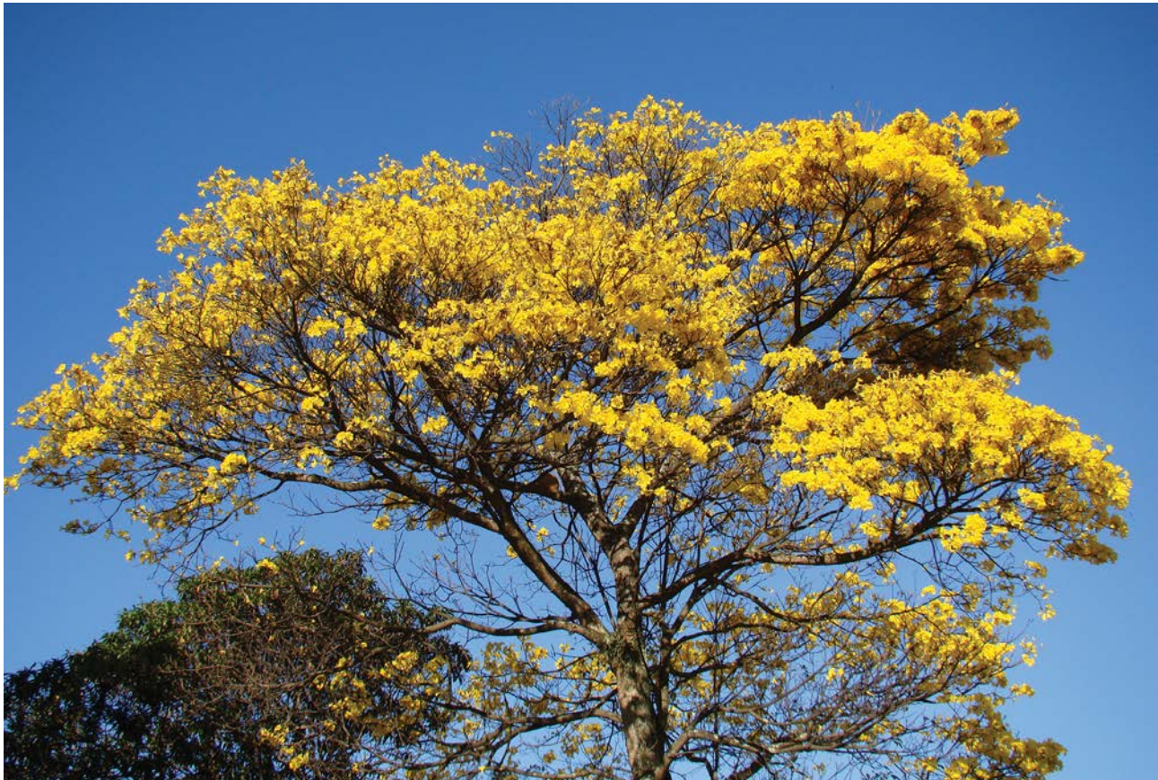
Brazilian walnut.

Brazilian Institute of the Environment and Renewable Natural Resources (IBAMA). The pictures showed stocks of logs and buildings of timber companies. IBAMA's satellite system confirmed the location of the pictures, leading to helicopter surveillance the same day. As a result, eight logging concessions were cancelled and several timber companies were expelled.