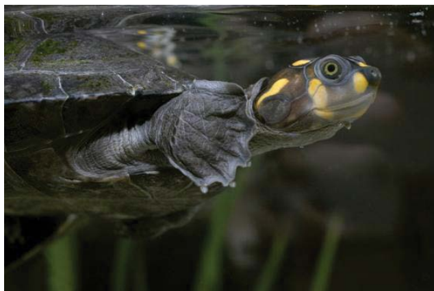
Yellow-spotted river turtle.

The project has overall reduced the commercial collection of turtles and their eggs, with local people more aware of the importance of the turtles in maintaining healthy aquatic environments. This has contributed to progress in restoring healthy populations of both species of river turtles, whose recovery will enable the indigenous communities to decide whether or not to set community quotas for the sustainable harvest of turtles in the future.