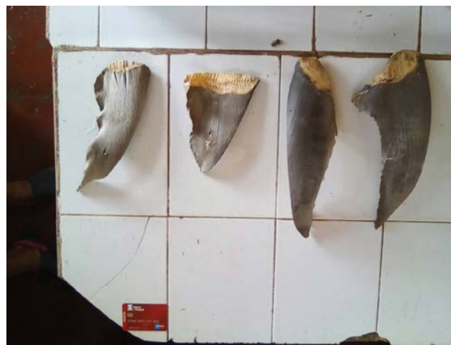
Fishermen drying shark fins for collection by illegal traders.

Free advertising for tourism services has helped to build a sense of community stewardship of sharks, and at the same time has transformed the local image. The result is a forthcoming meeting to allow fishing communities to share personal experiences.