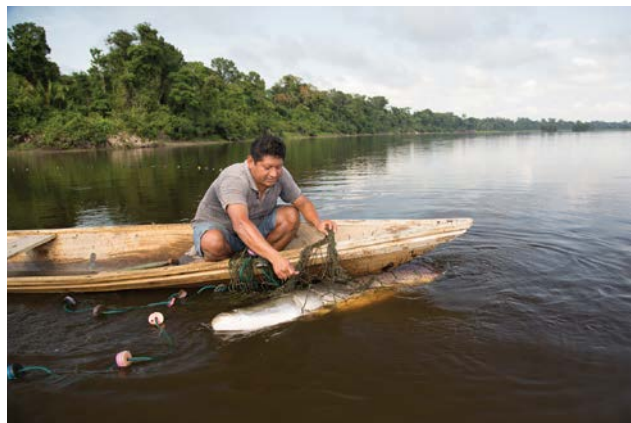
Paiche fishing.