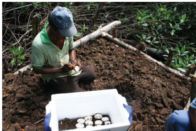
Collecting eggs from a raised platform.

The conservation and monitoring actions implemented by the local community led to the recovery of the bay's population of American crocodiles. The abundance of the crocodiles has increased steadily with all size classes represented in natural proportions, reducing pressure on the species and making it possible to sustainably use and manage the population. Overall, there has been a 200 per cent increase in the population in the Bay of Cispata. In addition, 9,000 crocodiles have been released into the wild.