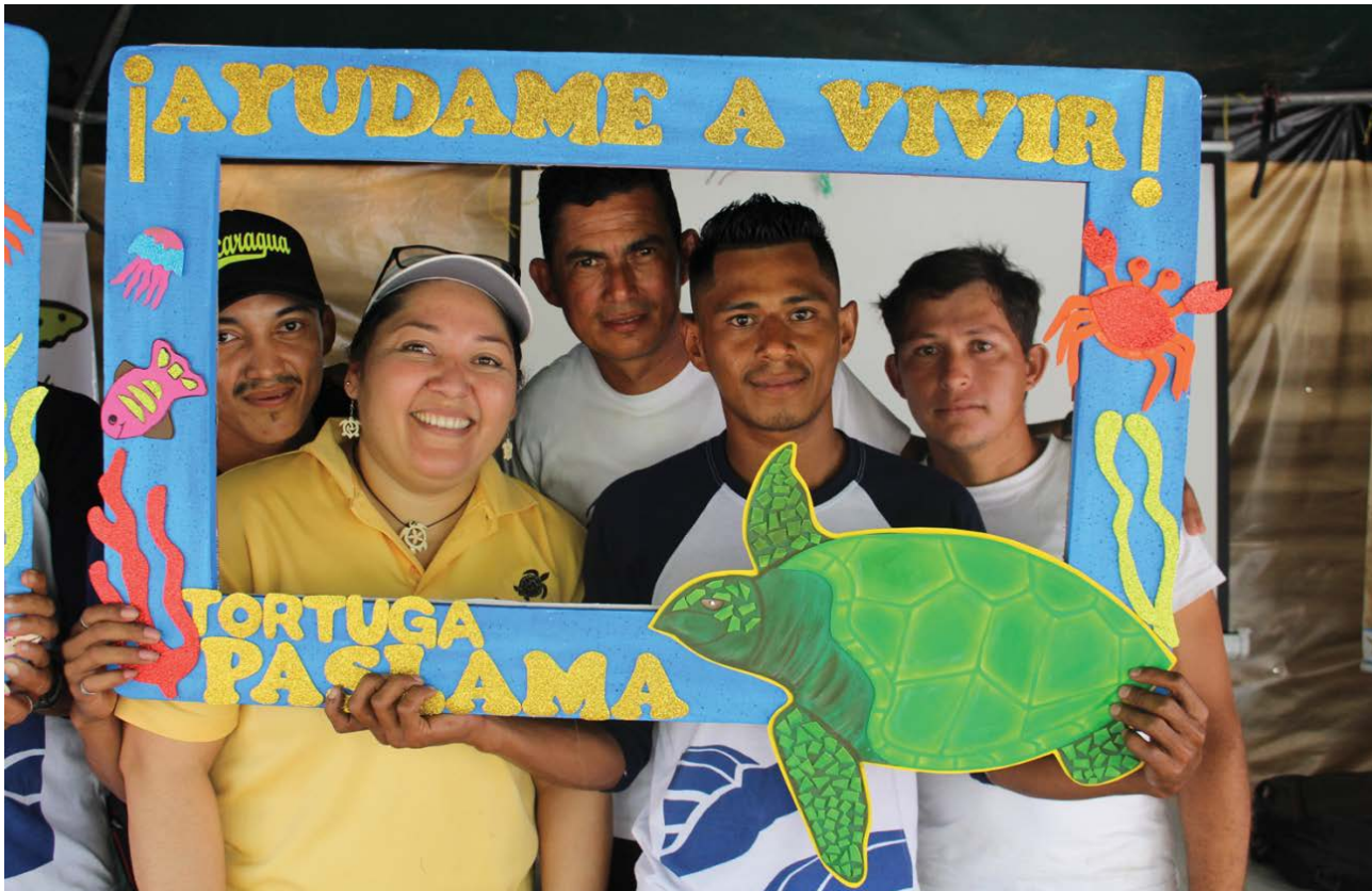
Help Olive Ridley turtles to live.