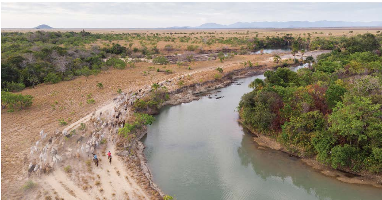
The Rupununi.