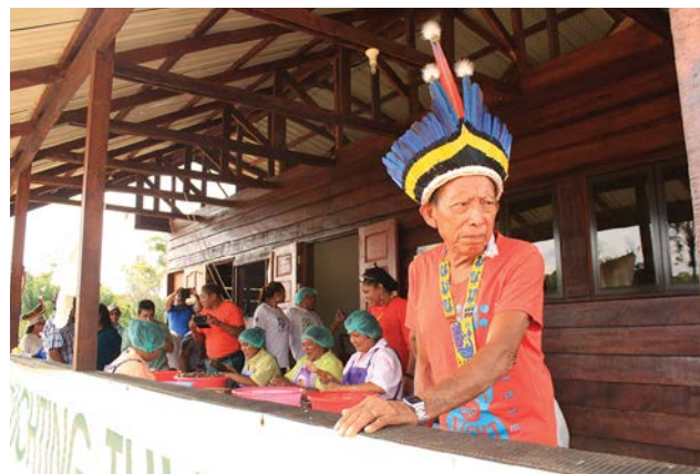
The factory.

Meetings were prepared and held with the involvement of the village to ensure the right messages were being discussed. This resulted in a better understanding of the project and more input from the village. To help build trust, Conservation International Suriname also carried out house visits so that all villagers knew their input was important to the design of the conservation agreement.