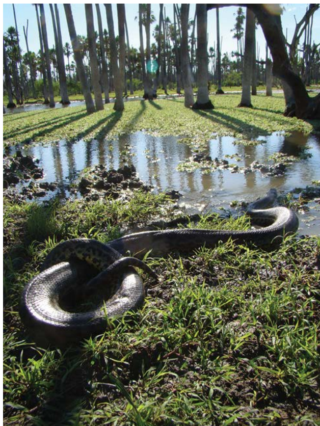
Natural habitat, Bañado La Estrella, Formosa, Argentina.

Poaching of this species has declined drastically and now virtually ceases to exist in Argentina. Local people receive clearly regulated economic incentives that reflect the effort involved in hunting. The hunting season coincides with a period of the year in which little other temporary employment is available for local people.