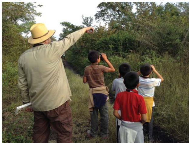
Children at a monitoring workshop.

The lack of regular, reliable funding has had a marked impact on the continuity of programme activities, at times limiting implementation. Changes taking place within institutional structures, such as the rotation of district authority officials add to this challenge. In some cases, partners and programme leaders have been deprived of support due to changes in institutional policy. In 2017, the Endangered Species Conservation Programme, which provided funding for the conservation of the reserve's parrots, was cancelled. This meant resources were devoted entirely to one particular flagship species at the expense of all other species which had previously benefitted from funding through that programme.