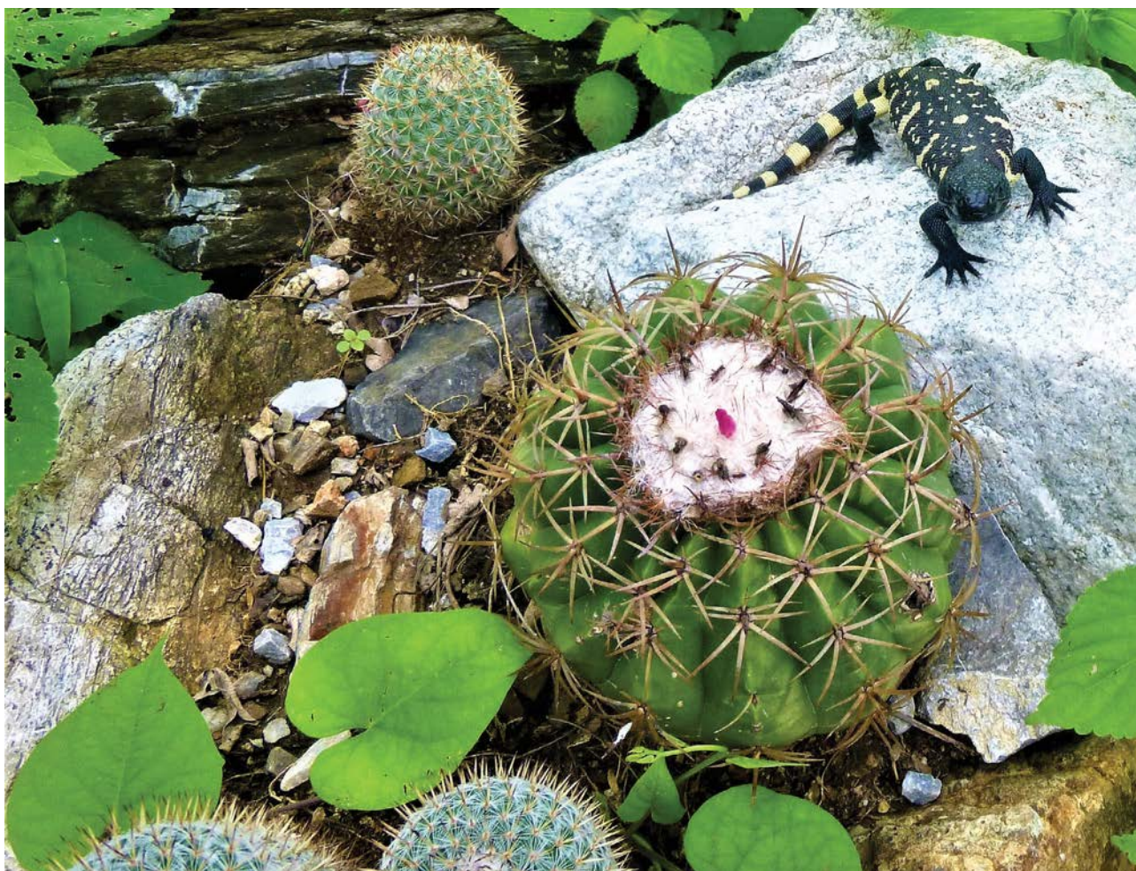
Guatemalan beaded lizard.