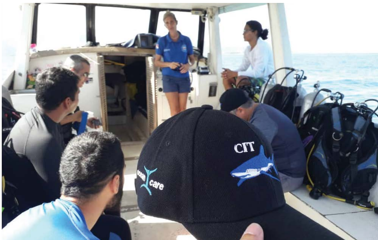
Planning.