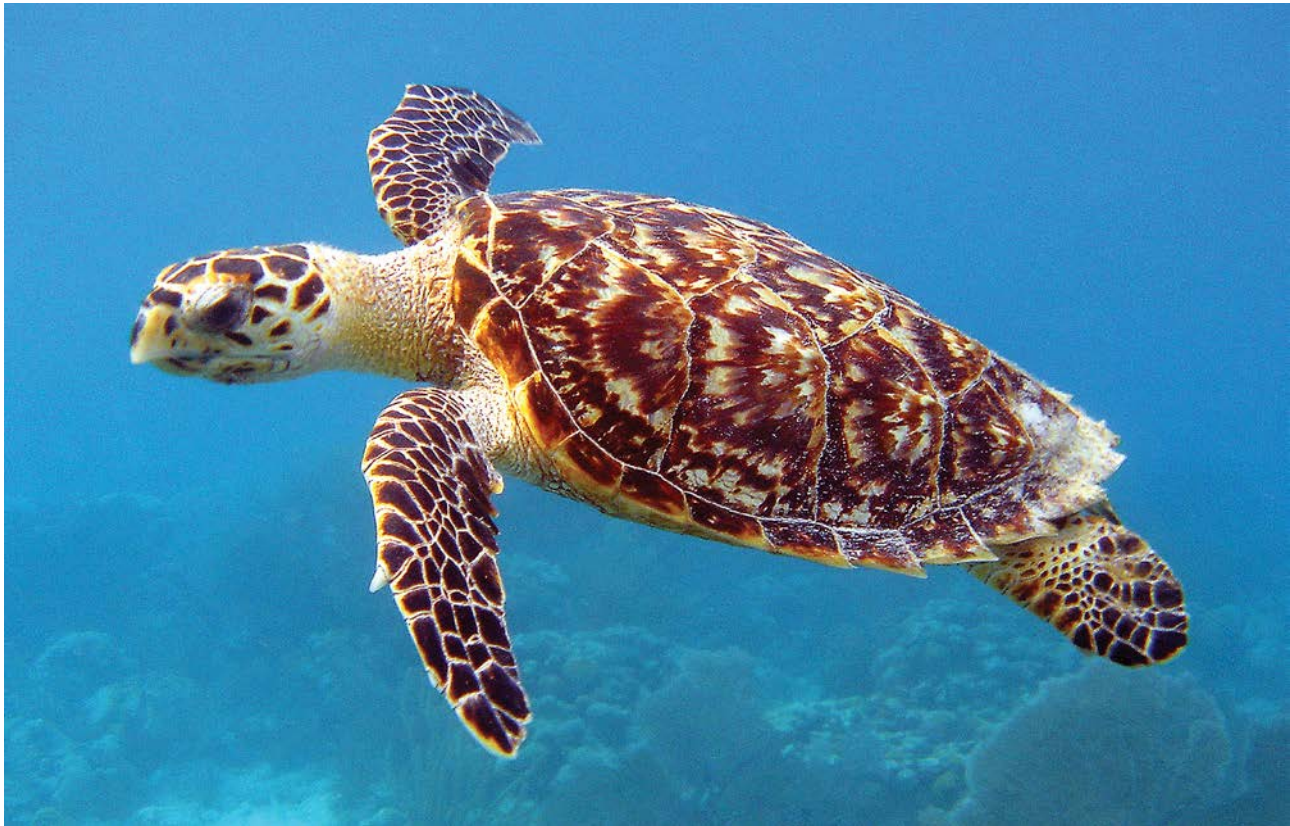
Hawksbill sea turtle.

ETC's presence, children were far less concerned with environmental issues and the programme shows the importance of educating the youth as key to successful conservation.