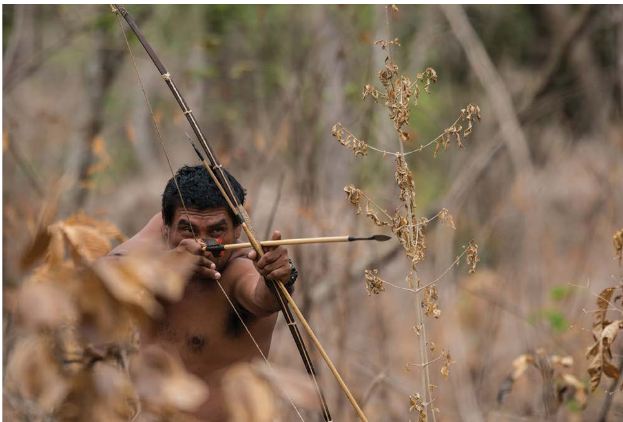
Indigenous hunter in the Rupununi.

Acknowledging the complexity of achieving positive outcomes that work both for people and wildlife, the programme is based on a multiple-entry approach that combines: