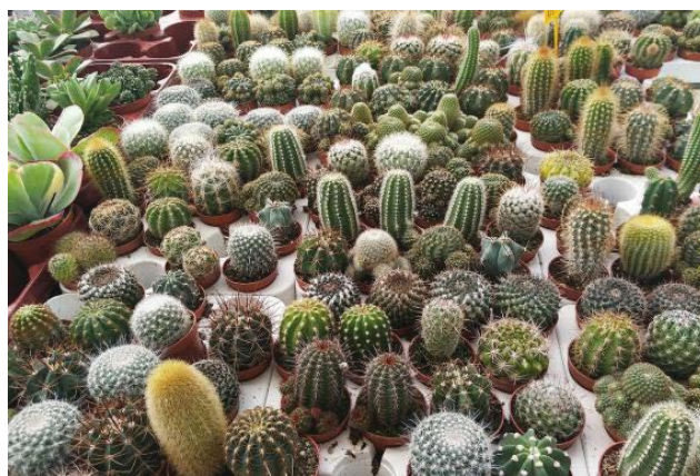
Cacti raised in nurseries.