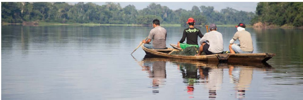
Ready to go to work.

The use of the arapaima under the programme is producing economic benefits for the local population, improving the livelihoods of the families in the communities involved. Direct benefits have been achieved for approximately 240 family members, with income generated from the sale of legally caught fish.