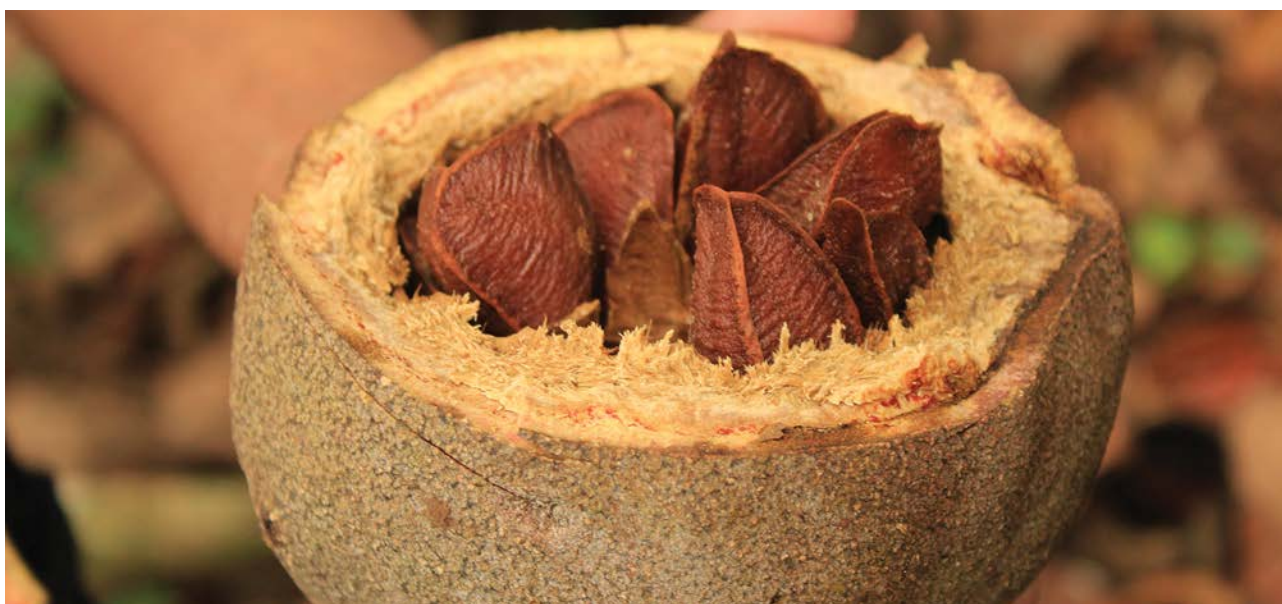
Brazil nut.