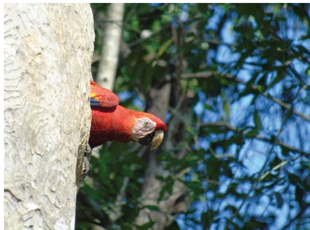
Northern Central America scarlet macaw in a nesting cavity in Laguna del Tigre National Park, Guatemala.