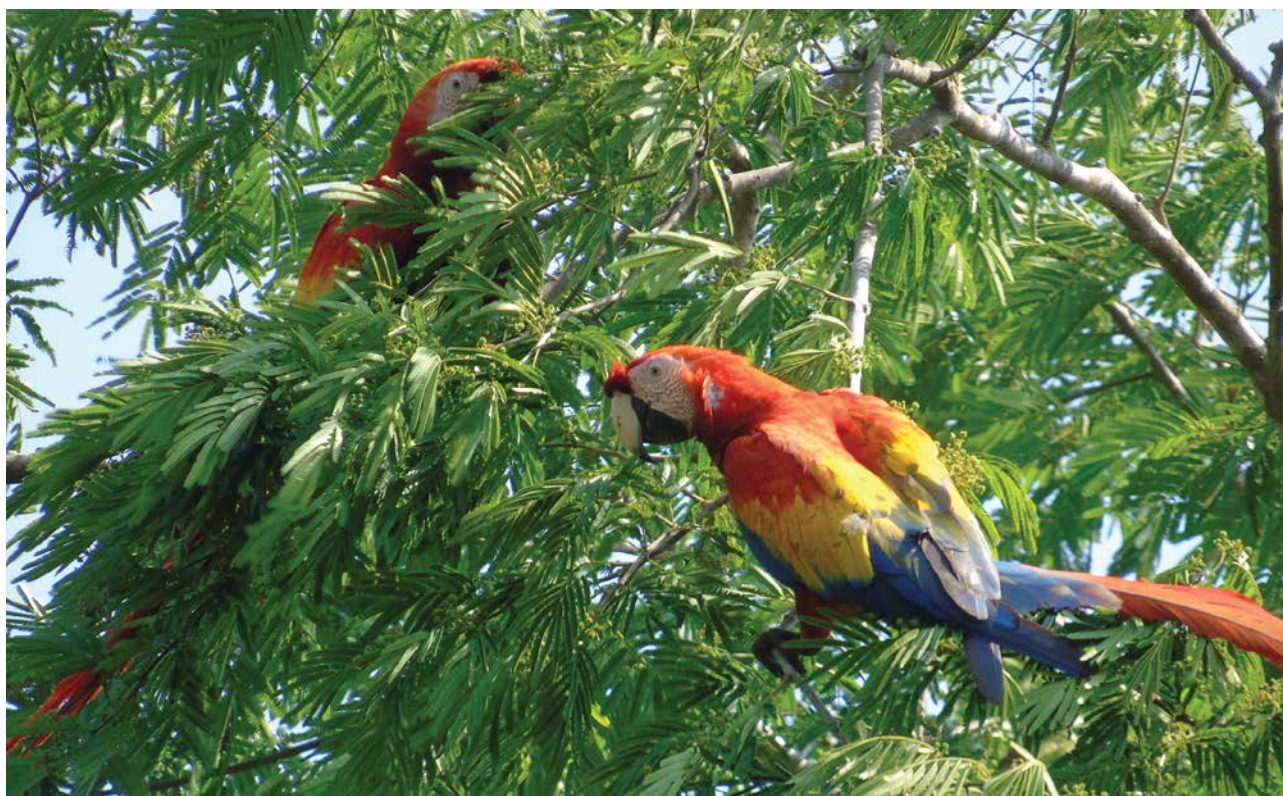
Breeding pair of scarlet macaws resting near their nesting site, Laguna del Tigre National Park, Guatemala.