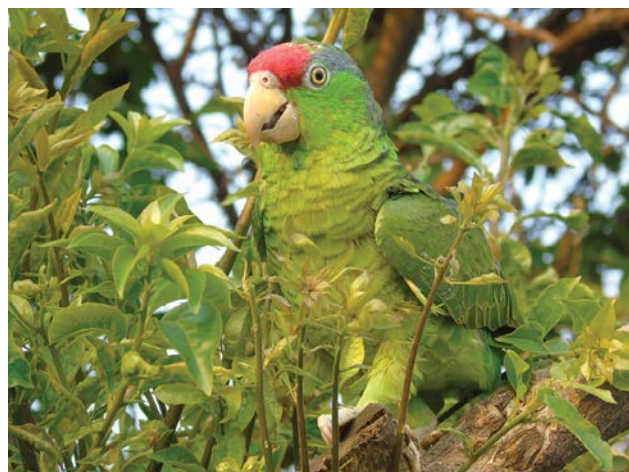
Red-Crowned Amazon ( Amazona viridigenalis).