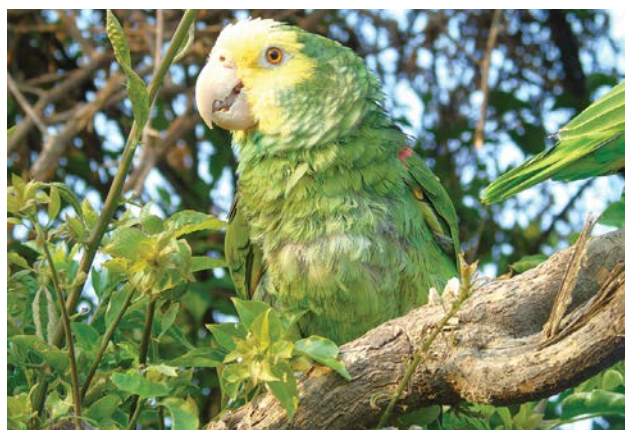
Yellow-Headed Amazon ( Amazona oratrix).