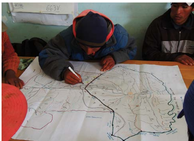
Making plans.

The range of different professionals working at each institution involved in the project has allowed appropriate support to individual communities.