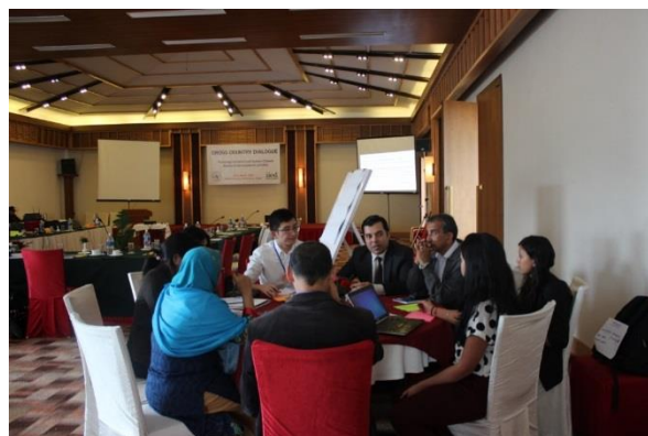
Group 1 discussing policy recommendations for LCRD investment