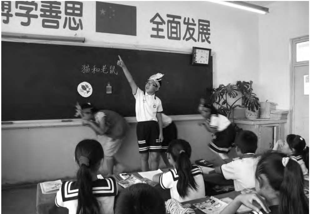
Students performing 'cat and mouse'.

reasonable evaluation mechanism for students' learning. From our experience, our advice on appropriate group evaluation methods is: