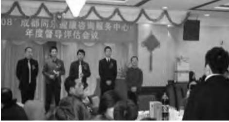
CGCO submits work statements and financial reports annually at a community conference and is questioned by community members.

despite the fact that the organisation had originally been formed in an inclusive way and its leaders are mainly from the target population. There needs to be a governance structure and process that entails genuine power sharing among the community.