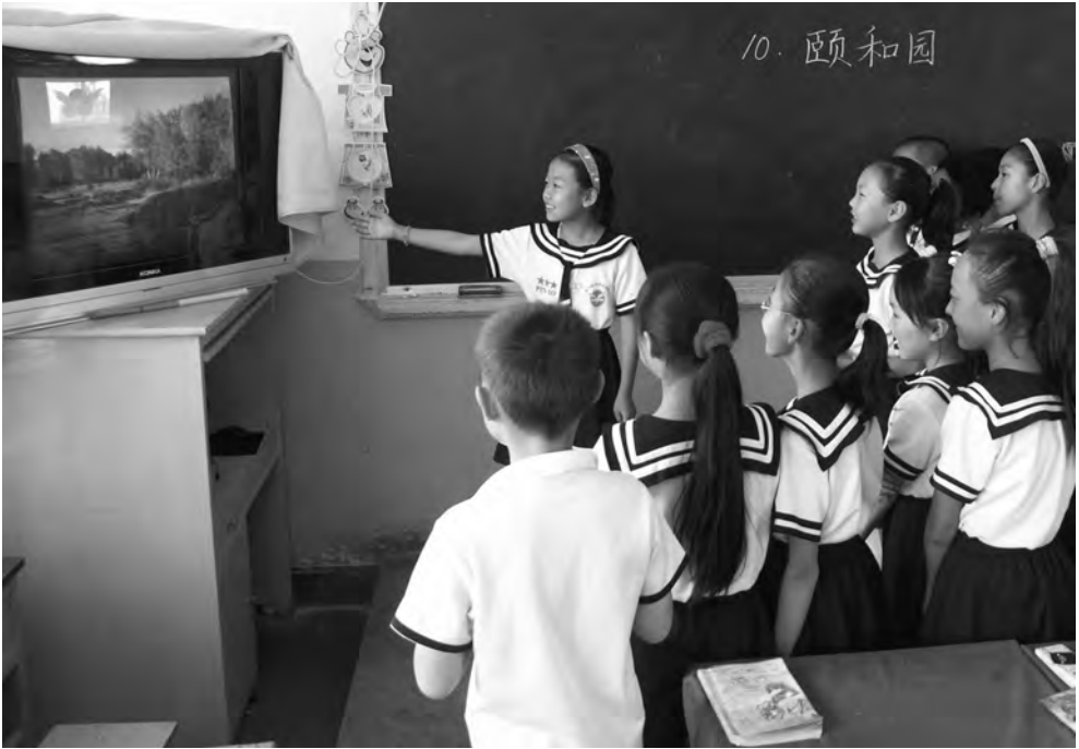
Students playing the role of 'tour guides' leading through a landscape video.

'guiding' them through the videos or pictures showing landscapes or cultural customs.