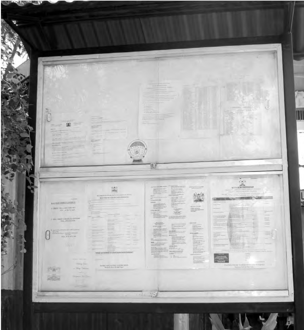
A public accountability board displaying information on community activities supported by the government. They are used to enhance transparency and accountability.

Creating a broader collaborative network among key champions is necessary for governance programmes to succeed. So too is communities' involvement in creating organisations which will shape and effectively implement the governance agendas. The Jipange governance initiative succeeded due to the involvement of sixteen individual youth groups that were beginning to gain a voice in the community. Through our joint collaboration, we were able to boldly undertake the governance programme and increase our