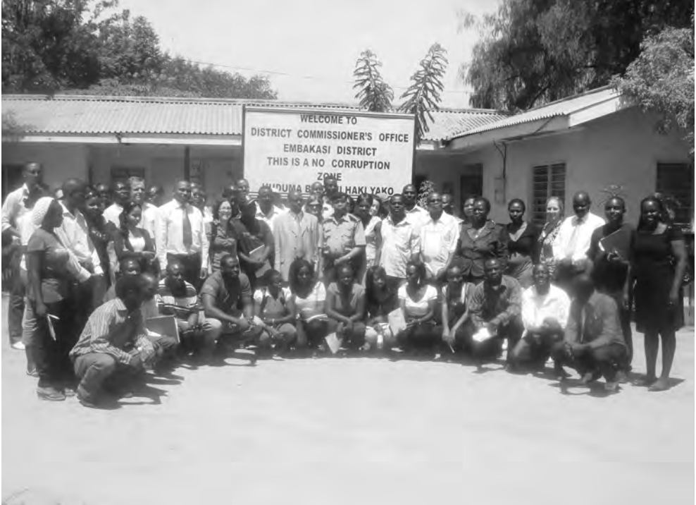
The Jipange Youth Organisation and visitors at the Plan regional youth and governance forum held at the Panafric Hotel.

interesting journey. Throughout the programme I facilitated almost all the capacity building workshops and forums organised by the youth group. In all the activities undertaken by the group, we consulted extensively and refined our approaches before implementation with technical assistance from the Plan Kenya Nairobi Urban Development Programme. The youths proved to be very organised and dedicated to the governance programme, which encouraged government officials to see them as partners in their daily activities.