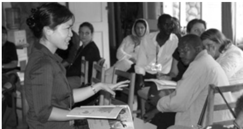
UNESCO's Yoshida Reiko at the Mapping for Change conference in Nairobi, 2005.