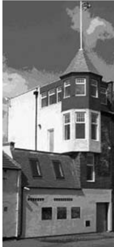
Photo: Malcolm Muir (permission granted by the Newbiggin Hall Sailing Club)

Sailing club members choosing which artist they would like to paint the installations for their wall.