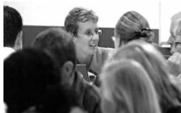
A facilitator from Opinion Leader Research leads participants through a nuclear power dialogue session.

... now Greenpeace would [be bound to] say that [the