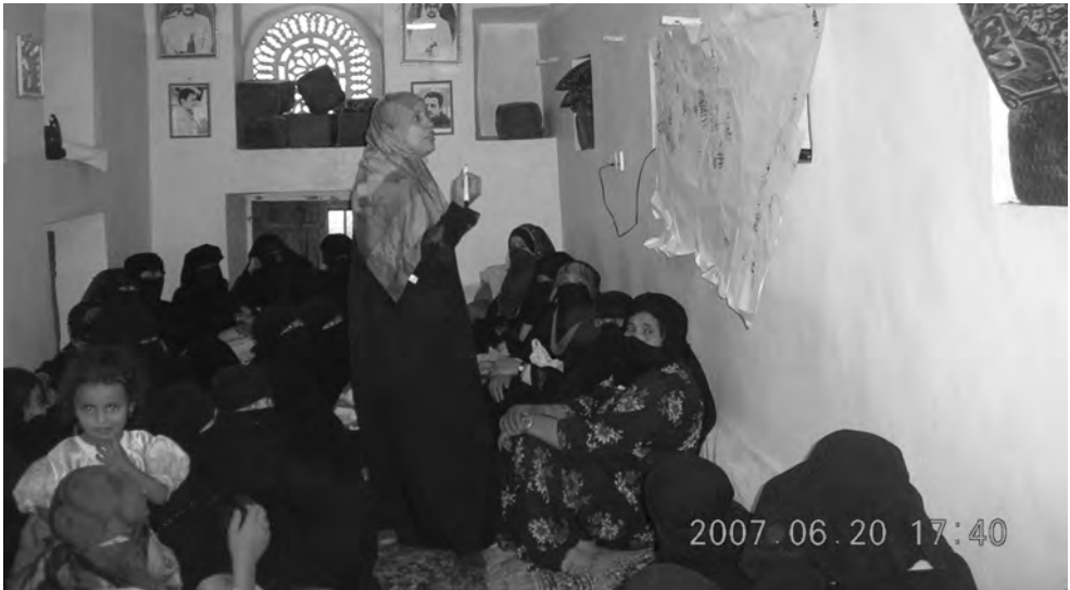
Woman facilitator from Social Fund for Development (SFD) Sana'a, triggering CLTS with village women in Ibb Governorate in Yemen.

Feel free to innovate and try out new methods apart from those described below.