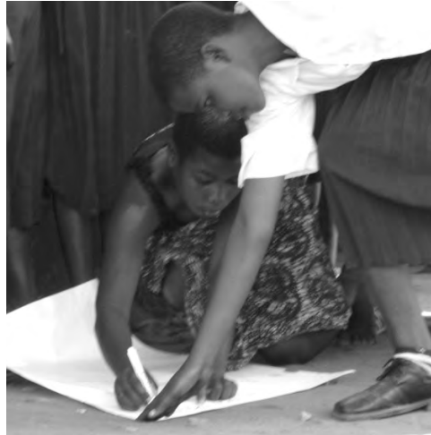
School girls in a Tanzanian village in action during a CLTS triggering session. Young adolescent girls are those affected the worst by the effects of open defecation. If facilitated properly they often take urgent action in stopping OD. Senior school girls in Bangladesh said that they were not late to school any more because they had latrines. Before CLTS they had to wait around the bush for an opportune moment when no men were around. They couldn't wake up before sunrise as their mothers did.