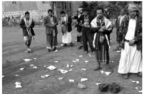
Mapping in progress in a village in Ibb Governorate, Yemen. In a well facilitated CLTS triggering process, many people work on the map together and indicate their households, areas of open defecation and calculate the amount of shit produced by the respective households.