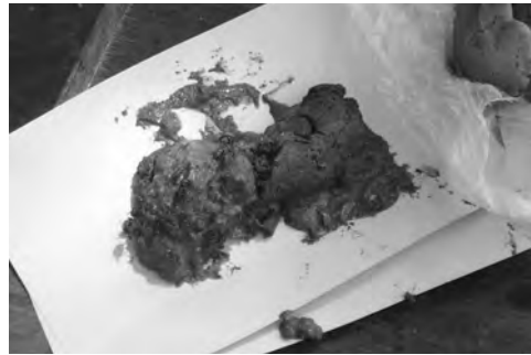
The 'shit, bread and flies' demonstration, Tororo, Uganda.