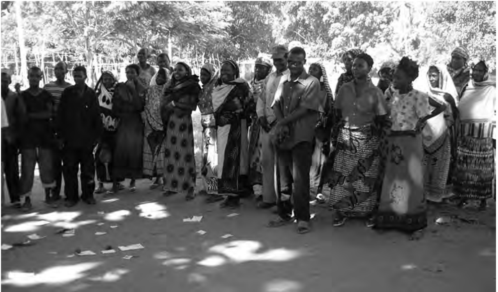
As the CLTS facilitators asked about areas of emergency defecation and defecation at work, the size of the village map extended far beyond the boundary which was made initially. This revealed new realities of defecation in Samba (an agricultural farm).