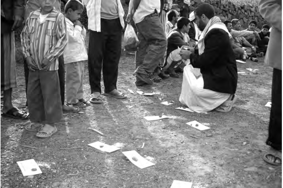
Calculation of household shit production is in progress, in a village in Yemen. Analysing the defecation area map along with the calculation of shit per household and faecal-oral transmission routes together with the community is extremely crucial.

They also benefit most from saving money spent on treatment of diarrhoea and other diseases.