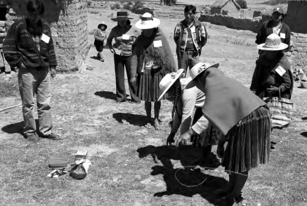
Women in a Bolivian village using woollen thread to draw a village map on the ground and show areas of OD.