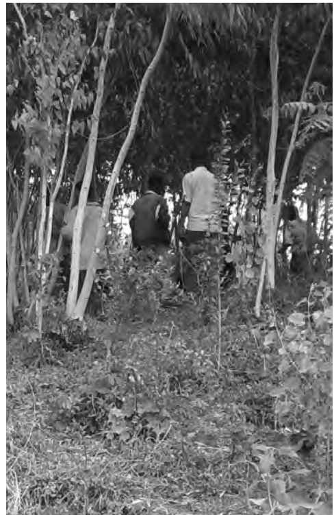
Walking through the bush to find the stuff! Rural community near Awassa, Ethiopia leading an OD transect team.