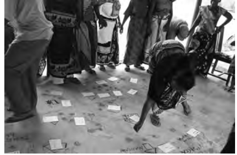
Women in villages in Ethiopia and Tanzania engaged in defecation area mapping including the places of emergency defecation. The amount of medical expenses for treatment of diarrhoea, dysentery etc. is also written on the cards against each household.