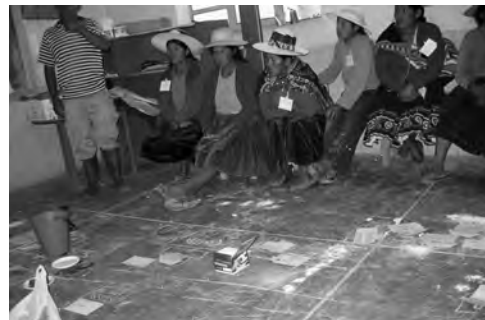
Yellow powder on the map shows defecation areas. As the CLTS triggering process moves on and the community indicates areas of emergency defecation, yellow patches on the map spread and increase. Anxious members of a community look on in a village in Bolivia. Be alert for capturing spontaneous comments of disgust and individuals wanting to stop all these.