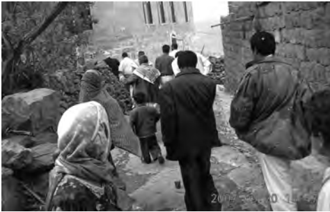
The suitable places for open defecation are identified by the local communities during a defecation area transect. Members of local community of a village in Ibb Governorate in Yemen leading an OD transect team to show potential places frequented by people in the morning and evening.

they smell and do they lick members of the family or play with the children? Once their interest is aroused you can encourage them to call other members of the community together. You will also need to find a place where a large number of people can stand or sit and work.