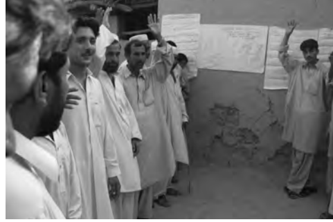
A community in a village in Mardan, NWFP, Pakistan raised their hands in total agreement to stop OD.

• Put up a flip chart and ask them to calculate how much the whole community spends in a month, a year, and then over ten years. Put this chart next to the calculation of amounts of shit by month, year and ten years.