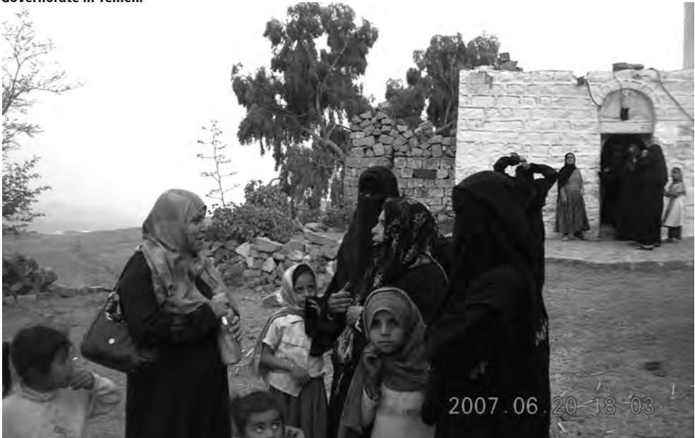
Participation of women facilitators in each CLTS triggering team is essential in Yemen, Pakistan and other Muslim countries. If a conducive environment is ensured and triggering meetings are arranged indoors or in places where no men could see them, women participate spontaneously, express their views and initiate collective actions against open defecation (OD).