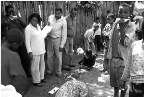
An exclusive mapping exercise with children is in progress in Shebadino village near Awassa in SSNP region in Ethiopia. This triggered CLTS that was primarily led by children and very powerful child natural leaders emerged from the exercise.