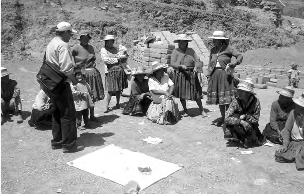
Women in an Andean village in Bolivia mapping their defecation areas: 'Who shits where?'

might say that during an emergency they go behind the house of their neighbour and similarly his neighbour comes to shit behind his kitchen garden. Everyone will notice that the map is gradually turning yellow. You can ask them whether the entire village seems to be full of shit.