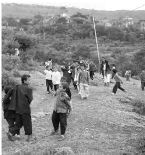
Children know all the locations of OD very well. Village children in Ibb Governorate, Yemen on a defecation area transect walk.