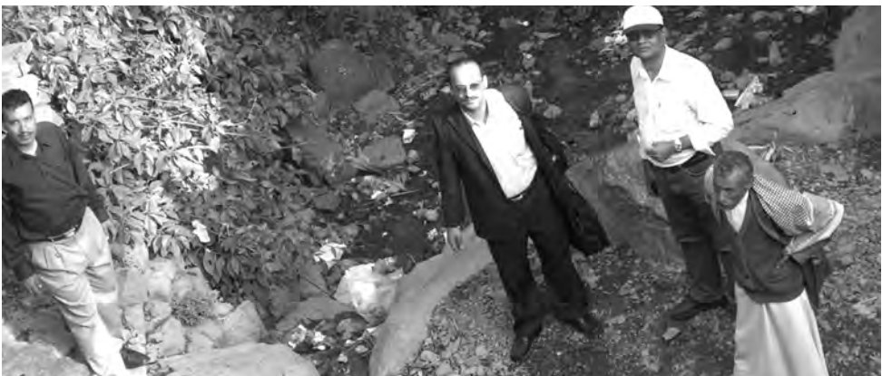
Within a short time the community took the team to a place far down the hill which was literally filthy and full of garbage, shit and plastics. This was also the main water collection point for the village. The place was right below the village mosque which had no toilet or wash place. People visited the mosque a number of times each day and many defecated and washed themselves before going to pray. Discussion on the spot acted as a very powerful trigger.

To get started, ask for a show of hands for questions like: 'Who has defecated in the open today?' and 'Have you seen or smelt human shit in your village today?'