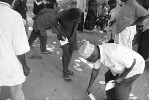
In a well facilitated CLTS triggering, villagers in Tanzania are calculating household shit. The ignition point is often reached while communities are doing this.