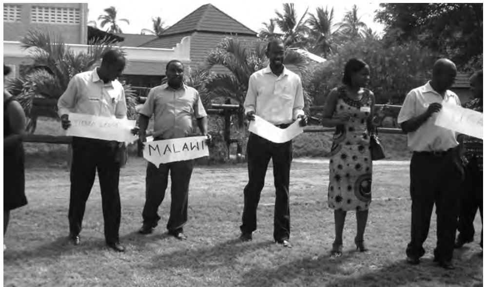
Participants at the CLTS in Africa workshop in Mombasa in March 2009 form country groups.

Sanitation (Sacosan) II (2006) and III (2008) and at African Conference on Sanitation and Hygiene (AfricaSan) in 2008. We capitalise on occasions like international and regional conferences, when people come together anyway, to (co)-host and facilitate these one day workshops, usually in collaboration with other organisations like Plan. Water and Sanitation Programme (WSP) or the United Nations Children's Fund (UNICEF). More recently, we have also co-convened two longer (one week) workshops: one with Plan Kenva on CLTS in Africa in Mombasa in March 2009, and another with UNICEF, WSP, Plan, WaterAid, Swiss Red Cross, LienAid and others on CLTS in the South East Asia and Pacific region in Phnom Penh in November 2009. Where possible, these workshops also include field visits to learn from practice first hand.