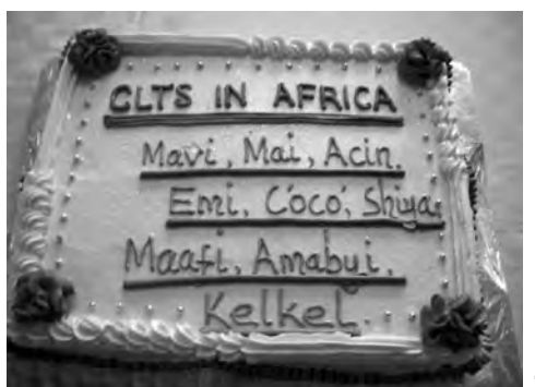
And to celebrate the end of the Mombasa workshop... This cake is literally covered in (international words for) shit.

The week-long forum gave all of us an opportunity to share our varied experiences and challenges on CLTS. I believe a good number of us (if not all!) were triggered and now strongly believe that CLTS approach is the way to go... I am sure we are all agreeable that documentation of what we are doing, sharing of best and promising practices and constant networking, are prerequisites for the success of CLTS. Let us keep the fire burning.