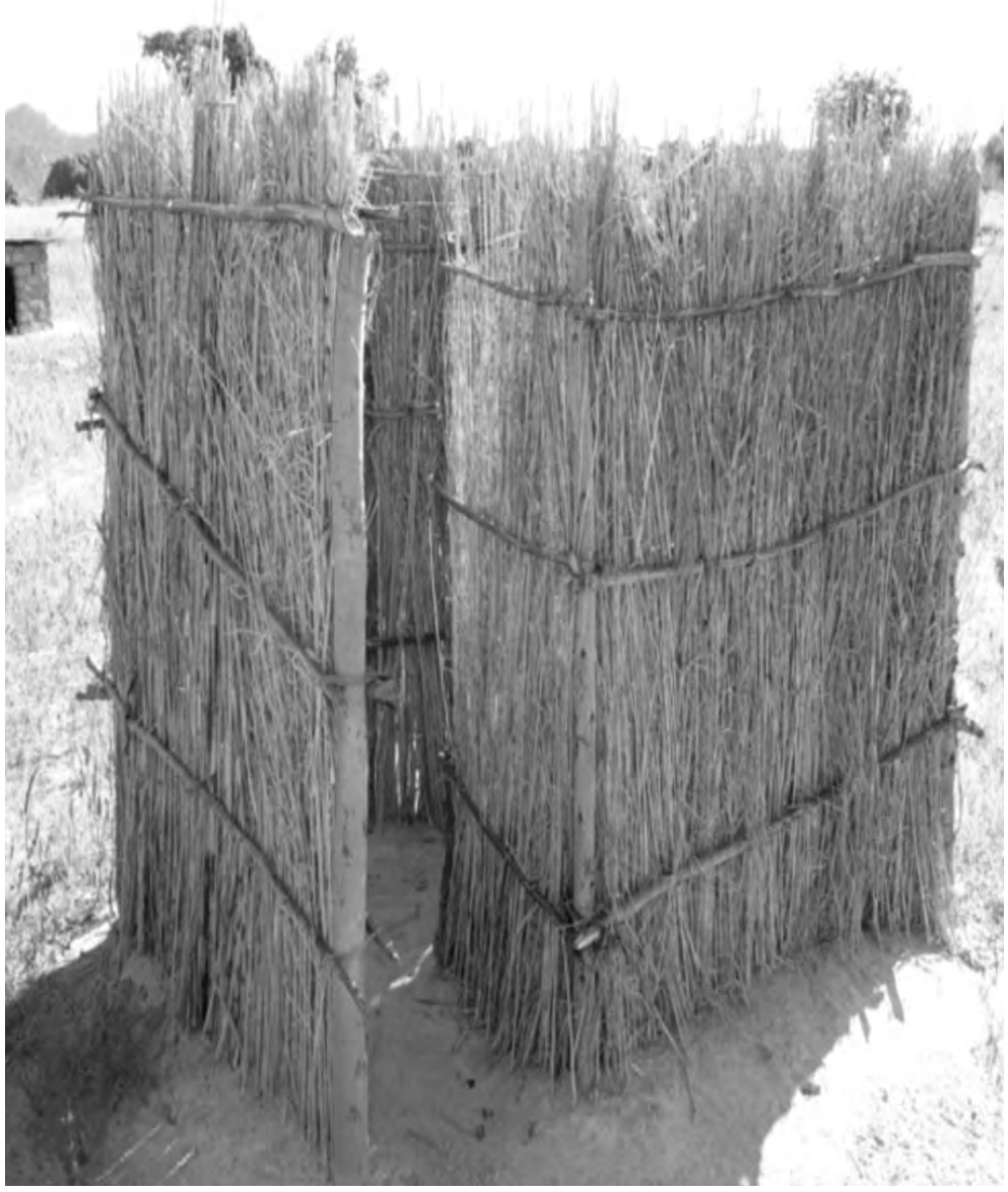
Pit latrine made from local materials.

providing subsidies presented barriers to the introduction of CLTS in the DWSSCs and in the communities.