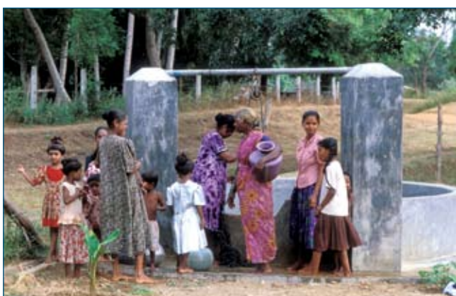
People collecting clean water, India

Box 1 gives an example of a CDCF project in Guyana that, although having an important aim to promote industrial activity, also provides both direct benefits in the form of electricity provision and indirect benefits to the local community.