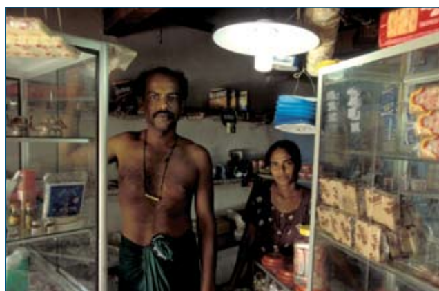
Solar energy is used to light a village shop, Sri Lanka

There is scientific consensus that the main cause of these climatic changes is human activity; in particular industrialization, based on burning fossil fuels (coal, oil, gas) that has occurred over the last 150 years, the clearing of forests and the intensifying of farming practices. These activities have increased the amount of greenhouse gases in the atmosphere, notably carbon dioxide, methane and nitrous oxide. These gases act like the glass roof of a greenhouse, trapping heat from the sun and preventing it from being reflected back into space. In normal quantities these gases play a useful function, preventing the earth from losing heat and becoming too cold for human habitation. But the build up of these gases in the atmosphere in ever-increasing quantities has the very negative effect of trapping too much heat. As a consequence, temperatures are increasing, leading to a rise in sea level and a range of related effects.