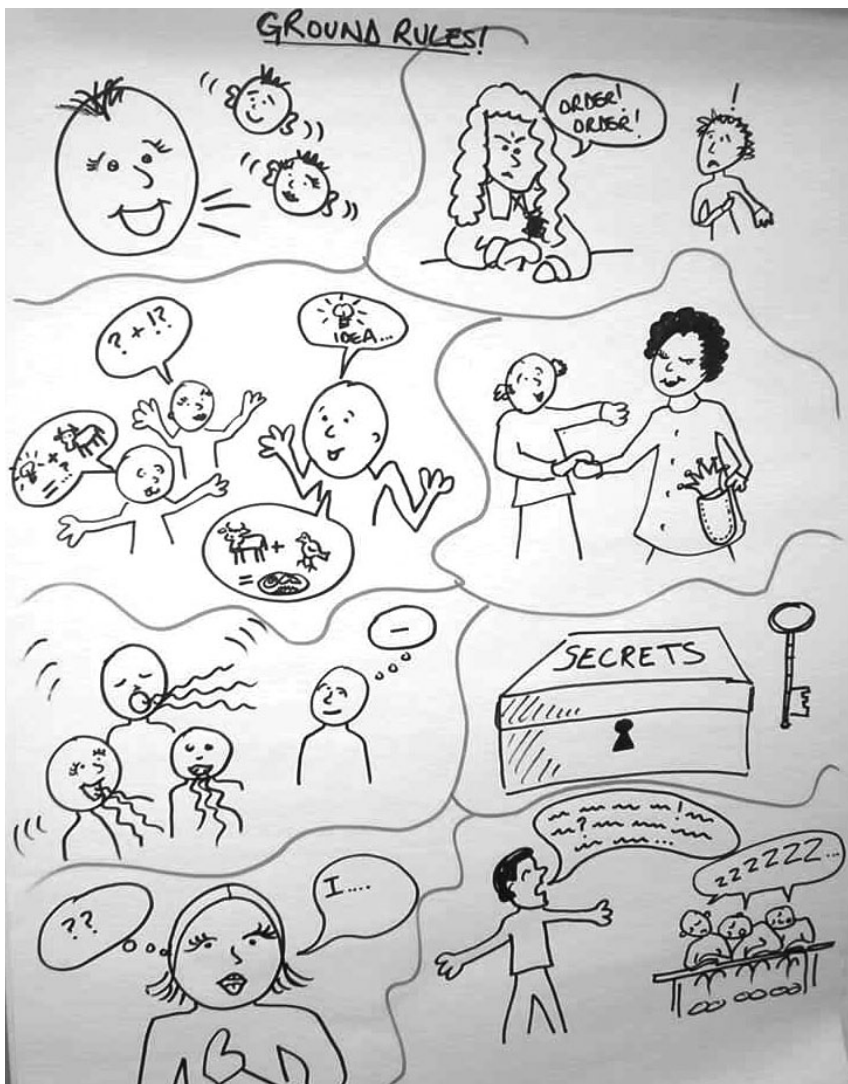
Drawing the ground rules – it's no Picasso!