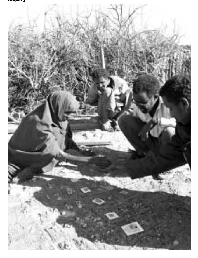
Well-regarded veterinary journals now publish 'scientific' papers describing local disease descriptions and epidemiology, as captured by participatory inquiry