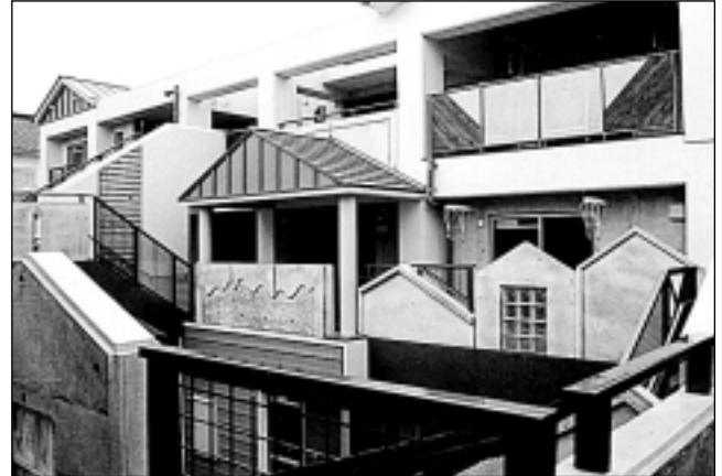
Figure 3 Public housing completed with moyai concept