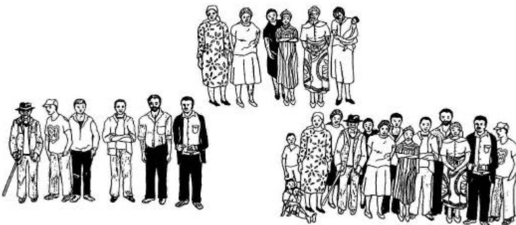
Figure 2. Set of three drawings depicting gender used for voting