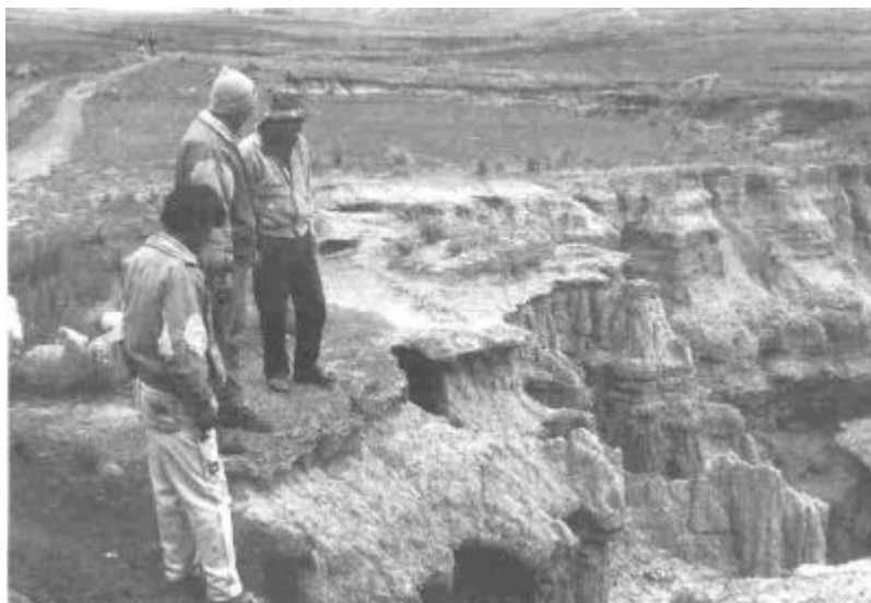
Figure 1. Photo showing farmers commenting on gullies during transects

Some months before PRA fieldwork began, we explained the proposal to community members and they agreed to take part. On our arrival, to begin five days of intensive fieldwork, we explained more carefully what we hoped to do in a community meeting. The village leaders assigned participants to work with us on each day's activities. The first day we began with 'ice-breaker' activities. We asked farmers to scratch maps of their communities with sticks on the ground and construct time lines of major events and land use. These activities were useful as they stimulated lots of discussion.