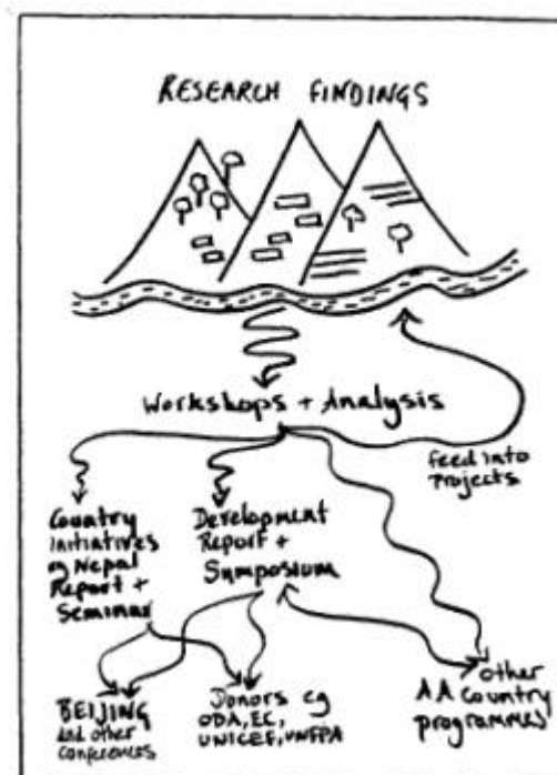
Figure 2. Disseminating research findings

Administration (ODA, 1995). The parallel event in Nepal was planned by ACTIONAID Nepal and made relevant to the national and international organisations working within Nepal. A special edition of the report was also produced in a style in which ACTIONAID Nepal felt was accessible to their audience.