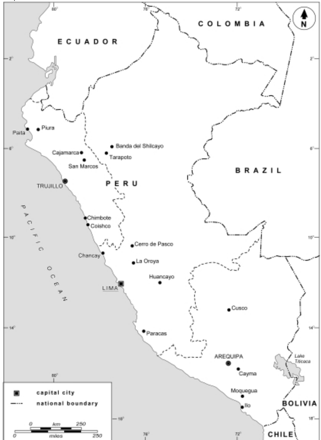
Map 1: Cities in Peru where there are Members of the Forum