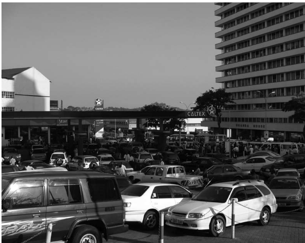
Queuing for petrol

This lacuna in the legal framework has been addressed by the new National Oil and Gas Policy. The policy officially launched in February 2008 aims to achieve exploitation and utilization of oil and gas in a manner that contributes to poverty eradication and "creates durable and sustainable social and economic capacity for the country" . Objectives also include national participation in the petroleum and gas industry, nature conservation and the use of revenues "to create lasting value for the entire nation" .