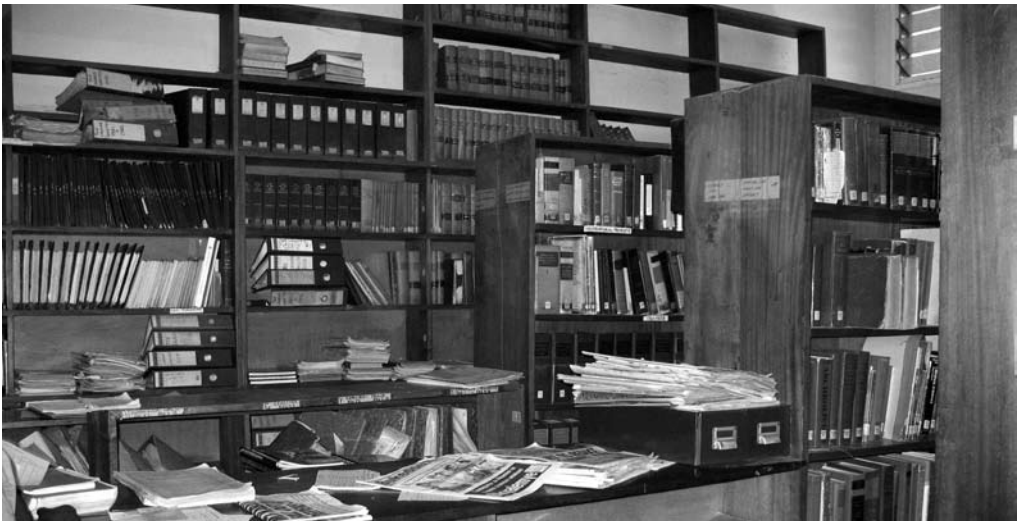
One of 2 rooms in the University of Kampala's law library

An oil company representative felt that there were “ massive information gaps and the quality of research very poor ”. There was no sufficient data on, for example, the sensitivity and biodiversity of Lake Albert around which most of the oil exploration activities take place. As a result the company undertook a one year programme to gather additional information. This assessment is partially confirmed by lack of contemporary research publications. The glossy brochure “ Opportunities for mining investment ” published in 2006 by the Ministry for Energy and Mineral Development merely contains references to reports and papers that are several decades old. 97