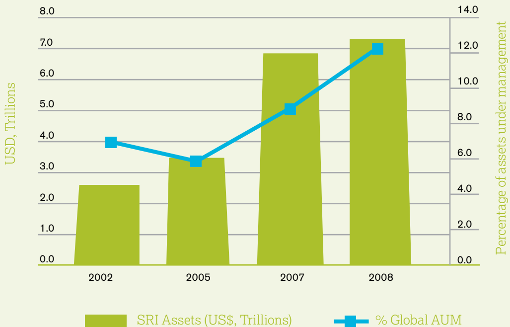
FIGURE I.1. GROWTH OF GLOBAL SRI ASSETS AND SRI MARKET SHARE, 2002–2008