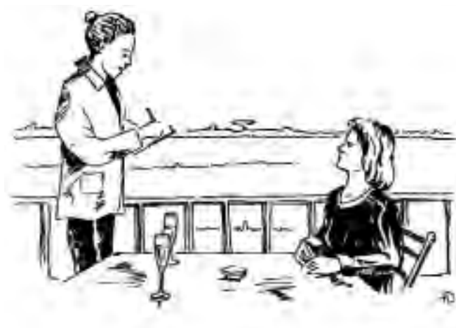
Employment opportunities will depend on the type of development