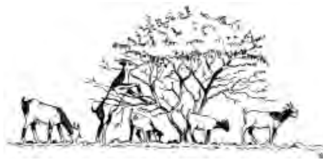
Land use priorities need to be established

This is important to establish how much revenue the community needs to generate at a minimum from its partnership arrangements in order to cover its costs.