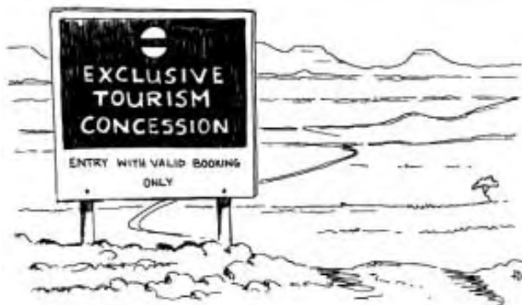
Right of exclusive use must be addressed as part of the financial component

This can be calculated by working out the direct costs of managing wildlife that need to be covered plus the indirect costs to the community – i.e. what could it get from alternative land uses? It is also necessary to consider whether other partnerships the community may be involved in will also be generating income to cover a portion of these costs.