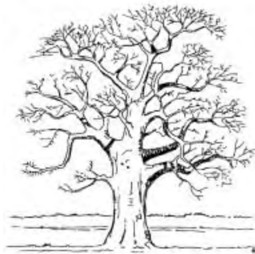
The value of various tourism assets needs to be clearly understood

Calculation of the contribution from both sides involves a certain amount of subjectivity and specialist input. The community will need assistance in checking that the equity share it is offered by the company is reasonable.