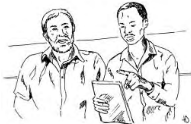
Involvement in management builds trust and increases the sense of ownership

Access to company accounts needs to be explicit in the agreement. Community members need to have the capacity to understand the accounts and decisions made on dividends or have access to assistance on this. The company can help by identifying people or organisations that can provide this input. Even so, in some cases it may be better to choose a different model of ownership and accommodate the community's desire for involvement in management or control in other ways.