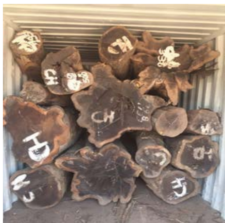
Packaged wood is loaded onto containers