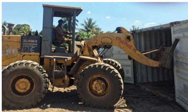
Packaging timber using a front loader

Once the request has been approved, a packaging assistance team is formed, which includes an SPF's law-enforcement officer and an agent of the Mozambican Tax Authority as per Decree 21/2011. Packaging can be done at a shipyard within or outside of the city or within the port area, and the exporter covers all costs of moving the team to the packaging place.