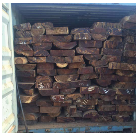
A container loaded with unsquared planks ready for transportation

During packaging, the SPF's officer is responsible for inspecting the volume and species of timber products to be exported, and detecting any irregularities. Based on their experience, the SPF's officers compare the volume requested by the applicant for export with the existing volume in the yard. For example, usually random samples of sawn wood are selected for volume estimation (measuring the length, width and thickness), and the sample volume is then multiplied by the total number of units that fit in the container to obtain the total volume. In the case of logs, the SPF officer estimates the volume by measuring the cross diameters (bark to bark) at both ends and applies the average diameter formula. However, because it is a slow process with cost implications, those procedures are not often used the volume claimed by the exporter is often used instead. As an example of cost implications, in Nacala, the packaging assistance is provided in the special cargo terminal. Packaging here must be done within a maximum of three days. The cost per container to be packed is Mt 7,800. If the process exceeds three days, there is an additional cost of Mt 250 per day per container.