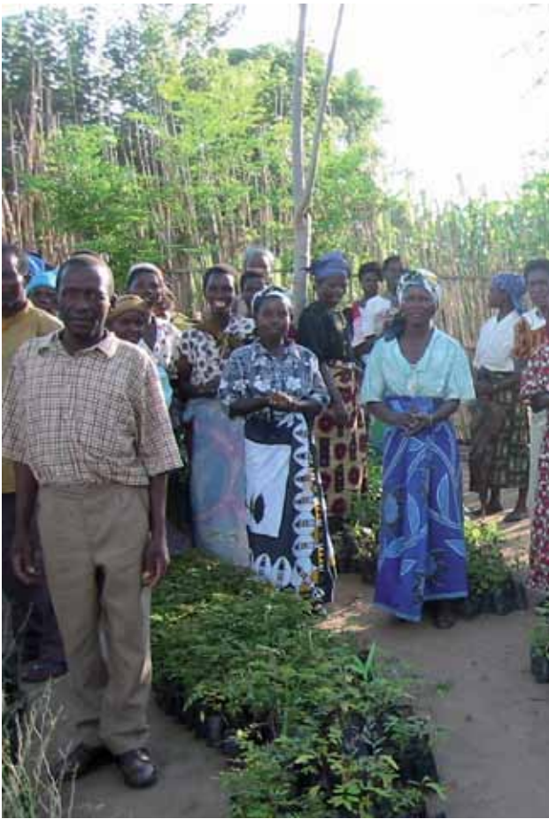
Community tree nursery – Salima district