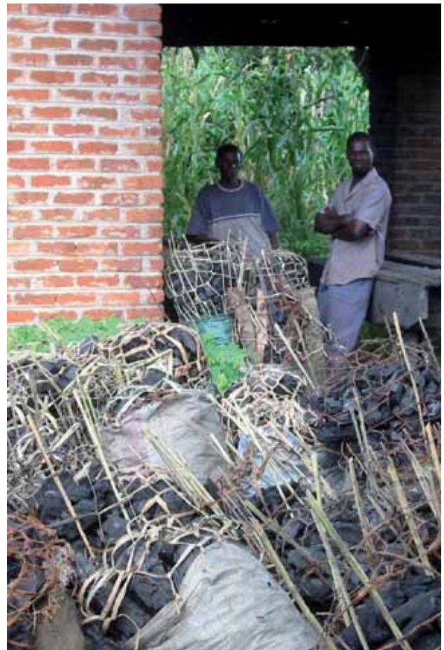
Confiscated charcoal – no incentives for sustainable production