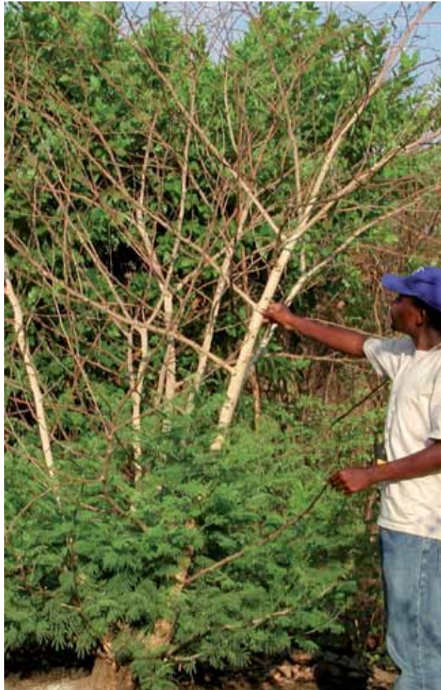
Acacia regrowth after coppicing