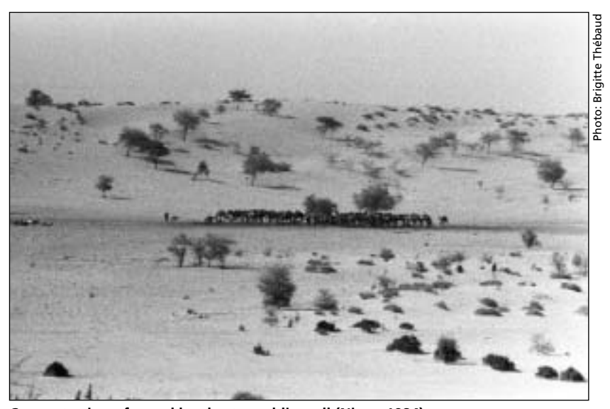
Concentration of camel herds at a public well (Niger, 1984)

The introduction of de facto open-access water infrastructure in pastoral areas had a strong impact on the management of pastoral resources. For herders, it soon became apparent that access to cement-lined wells and boreholes was open to all. This undermined the traditional resource management systems described above. Rangelands where local pastoralists would have priority use rights (through control of traditional wells) became accessible to all, as incoming herders would water their livestock at state-provided water points. Public water points attracted ever larger numbers of herds to the area. As borehole technology enabled greater numbers of livestock to be watered, surrounding rangelands were rapidly depleted. Securing access to water became associated with the use of force, rather than with negotiation and reciprocity (see section below). In Eastern Niger, the construction of public wells resulted in a decrease in the number of traditional wells located within the radius of influence of the public wells and, as a result, in a concentration of livestock around fewer numbers of water points – thus fostering resource degradation.