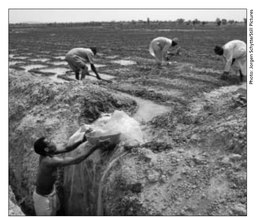
Traditional irrigation system, Niger. Farmers watering a field in the Zinder region, used to grow melons and other vegetables.

("désaffecte") land from the land users, and allocates it to the irrigation agency (in our case, the SAED) for irrigation development. No cash compensation is paid. However, the original landholders usually manage to obtain irrigated plots after the construction works (study fieldwork).