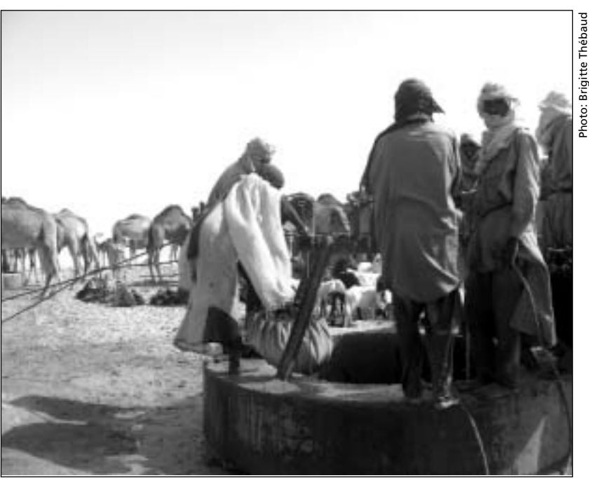
Watering camels at a modern well (Niger, 2005)

At the beginning of the 1980s, a series of rainfall deficits forced large numbers of Fulani herders to migrate South, to Northern Nigeria. In 1984, groups of Toubou and Arabs living north of the Dillia crossed the valley and took control over a number of public wells within FulBe terri-