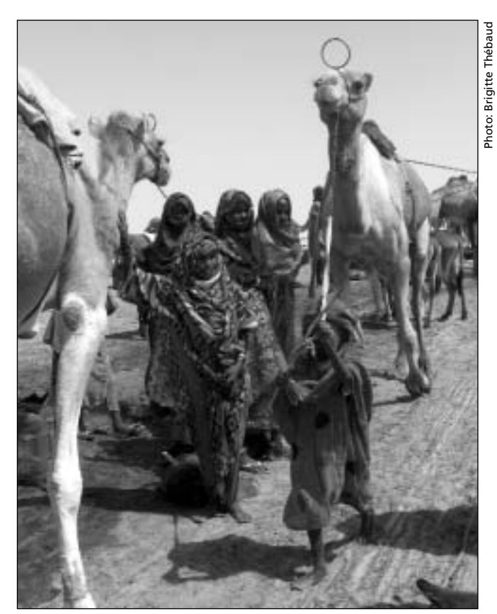
Young girl leading a camel to extract water (Niger, 2005)

and outsiders. Such conditions include length of stay, health of visiting herds and time of the day for watering. Limiting the length of stay of incoming herders is a key tool to limit livestock numbers around the well. It therefore serves as a mechanism to regulate access not only to water, but also to the surrounding rangelands. This is essential to prevent rapid grazing and ensure sustainable land use. Through these negotiations, residents also reassert their priority rights over the well. For close neighbours, the "protocol" is minimal, compared to more distant ones. Payment can take various forms: money to help financing the construction of a new well; tea and sugar; a small ruminant; or, in some cases, the lending of a cow for reproduction purposes. Incoming herders also offer to residents reciprocal access to their wells if/when needed – for instance,