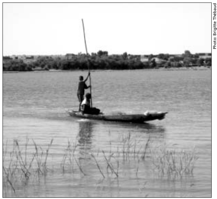
Harvesting rice and fishing on the Niger River (Gao, Mali, 2005)

Secondly, in wetland ecosystems, relations of interdependence exist between rights over different natural resources – not only water and land, but also fisheries, grazing and other resources. In our case study from the Inner Niger Delta (Mali), for instance, probably the most prized resource is a grass that provides highly valued dry season pasture ("Echinochla stagnina", commonly called "burgu"). To capture this complexity, this chapter broadens the scope of the analysis from a land/water rights focus to the linkages between rights over all the natural resources existing in a given territory.