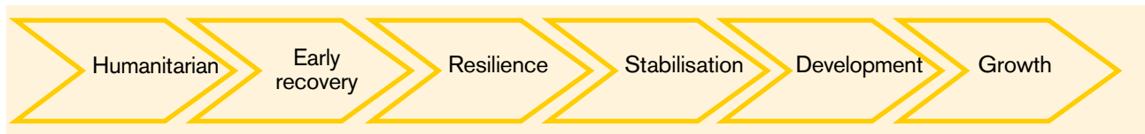
Figure 2. Stages of response

humanitarian and development programming (ODI 2016). Indeed, ODI has even established a 'resilience scan' report to track the usage of the term 'resilience' in humanitarian and development settings. Two questions remain, however: on which side of the spectrum does resilience fall and where does one give way to the other?