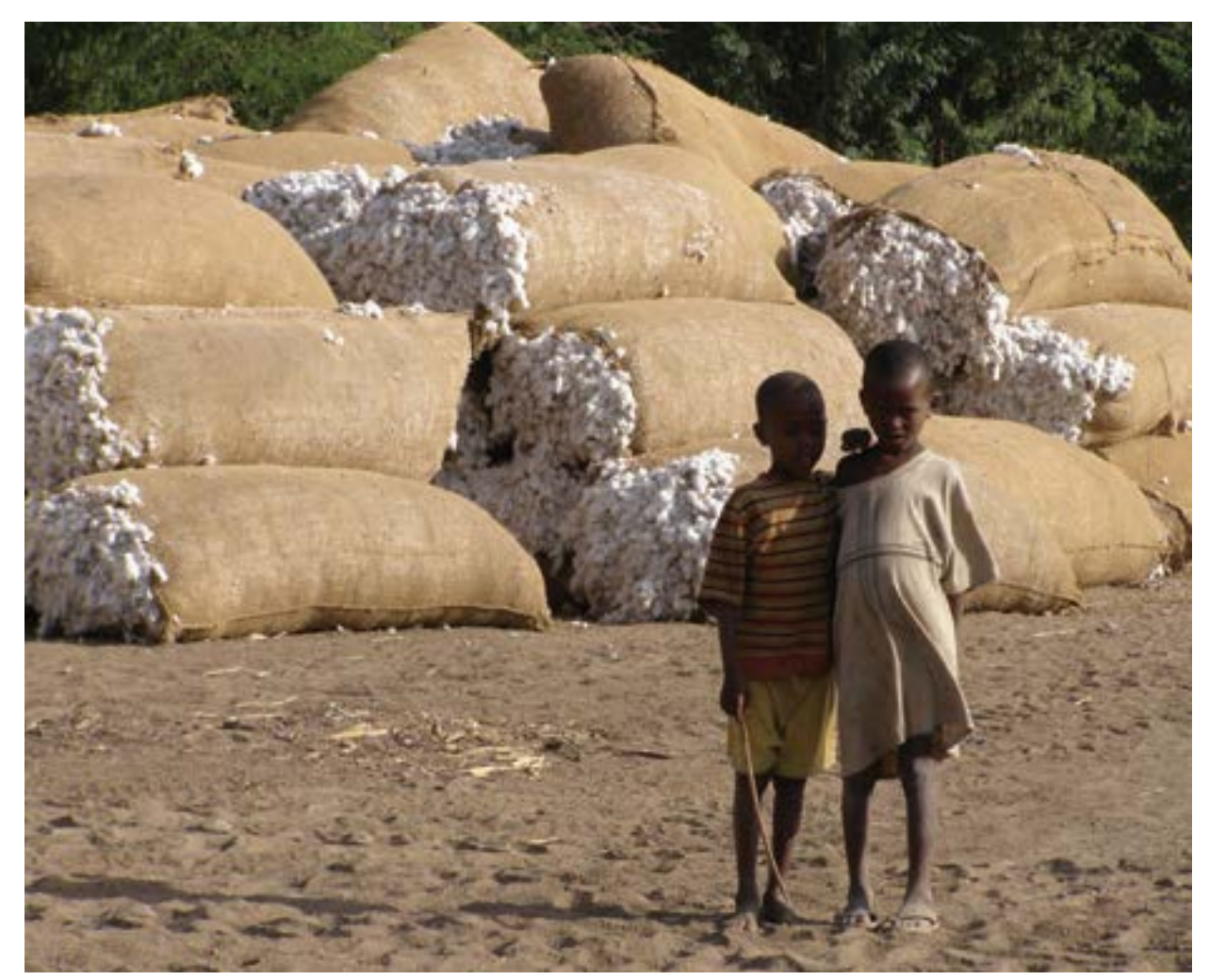
Raw cotton on private farm

match the lower estimates of the returns per hectare to pastoralism. This assessment is based on a like-for-like comparison of relatively unprocessed agricultural and pastoral output – unginned cotton versus live animals, milk and home-preserved milk products. The real profitability of cotton farming arises not from farming itself but from the value added by industrial processing and export – the transformation of raw cotton into lint cotton that can be sold on high-priced international markets. As the next section will show, much the same results emerge from an analysis of sugar cane cultivation.