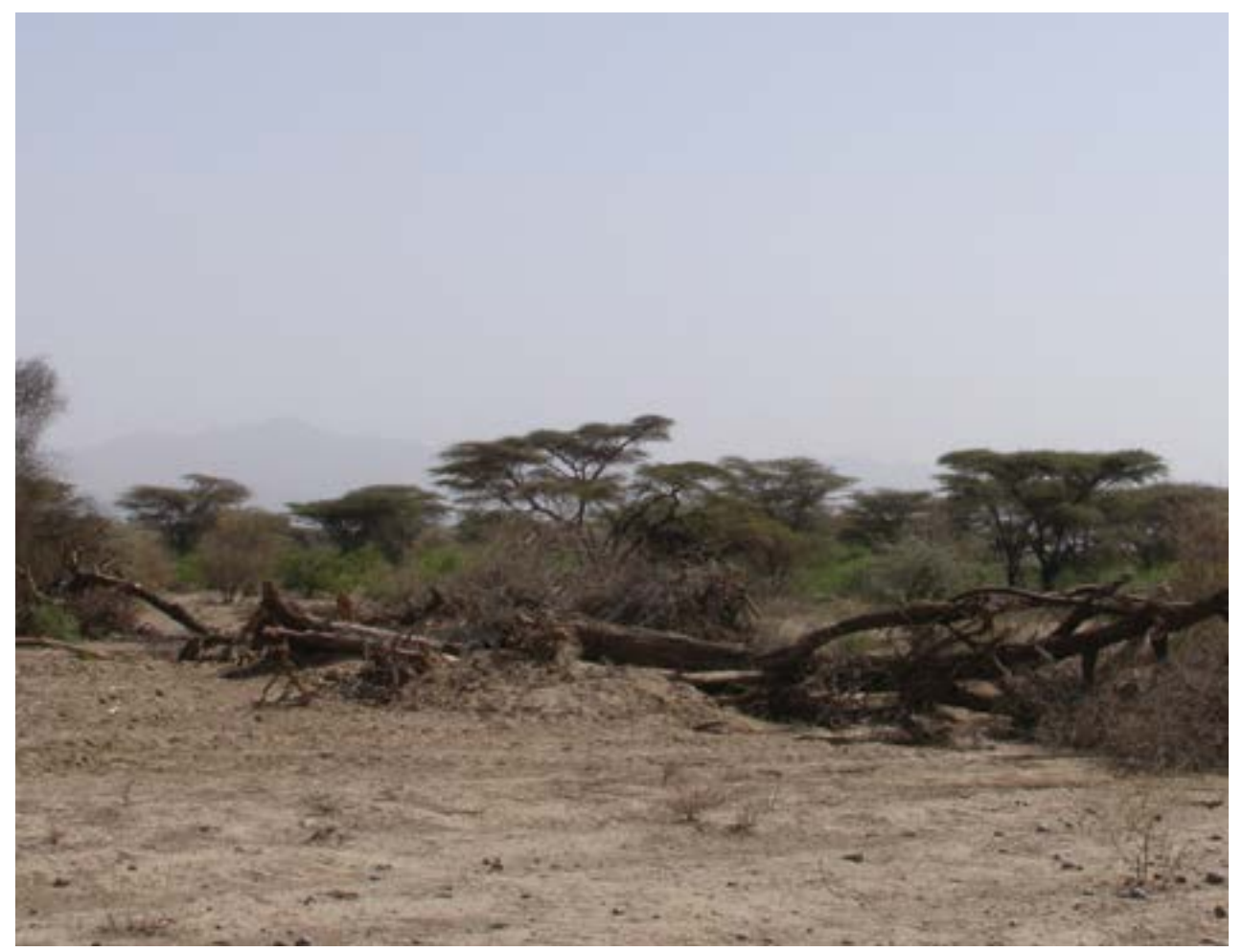
Clearing the riverine forest for sugar plantations

state cotton farms lost money for decades. Current development programmes suggest that the Ethiopian government is aware of this situation. For some time it has been either turning the operation of its cotton holdings over to private interests – the Afar clans or investors – or transforming old government cotton farms into sugar plantations. The state's sugar estates are more profitable than its old cotton estates, but whether farming sugar cane is more profitable than livestock production is doubtful. Pastoralists in Afar are nonetheless currently losing additional land to expanding state-owned sugar plantations. Later sections of this paper clarify the economic returns and losses to this conversion.