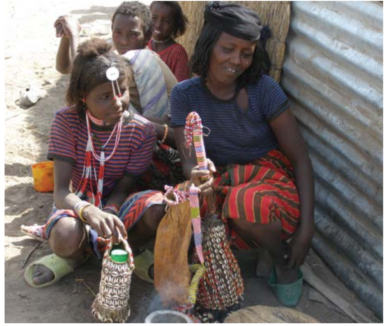
Afar pastoralists with their milk and butter containers