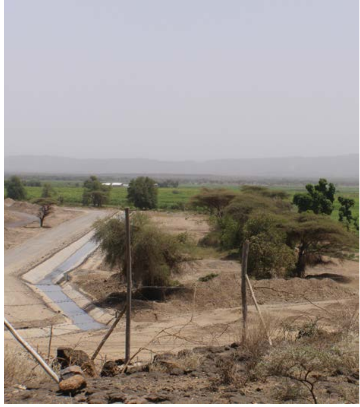
Canal and ditch