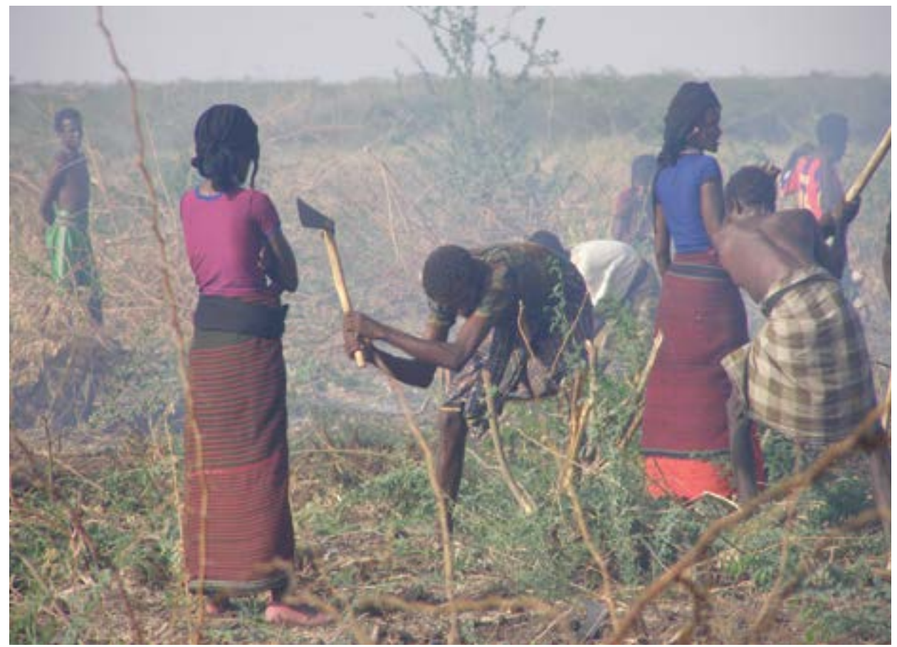
Clearing Prosopis to make cotton fields | Photo credit: C. Kerven

Source: Unpublished MAADE records, 2004-09.