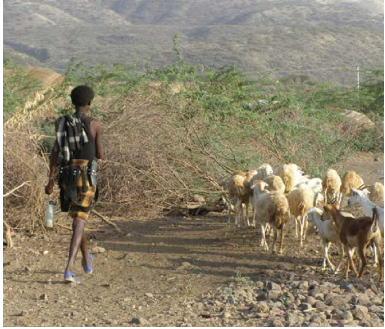
Afar herder with gun belt