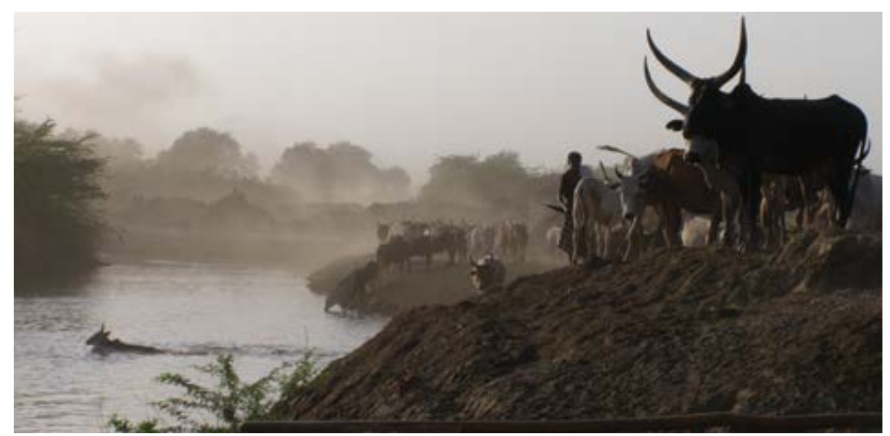
Afar cattle

By the early 1970s, pastoralists along the Awash were rapidly losing their riverine grazing due to upstream hydroelectric projects that regulated river flow, and to land concessions granted by the then Imperial Ethiopian government to international agricultural companies for the development of irrigated cotton and sugar plantations (Cossins, 1972; Bondestam, 1974; Emmanuel, 1975; Flood, 1976; Kloos, 1982; Gamaledin, 1993, 1987). Much of the riparian forests that once supported traditional Afar pastoralism have been bulldozed under and replaced by irrigated or abandoned fields. It is difficult to conceive of these areas - many of them now damaged by soil salinity and bush encroachment – ever returning to natural vegetation and pastoral use. For the Awash valley there probably is no turning back. An evaluation of agricultural development in the Awash is nonetheless important because the Awash exemplifies general development trends in Ethiopia (Kloos and Legesse, 2010), and more broadly across semi-arid Africa (Adams, 1992). Like no other part of Ethiopia, the Awash valley illustrates what lies in store for pastoral areas if African governments pursue a policy of modernising agriculture by displacing mobile livestock production in favour of irrigated crop agriculture.