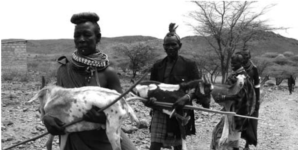
People bringing their weakened animals to an Oxfam destocking programme.