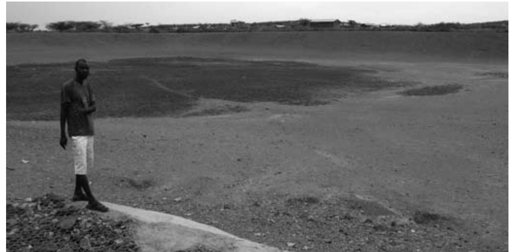
Dry waterhole, Turkana.