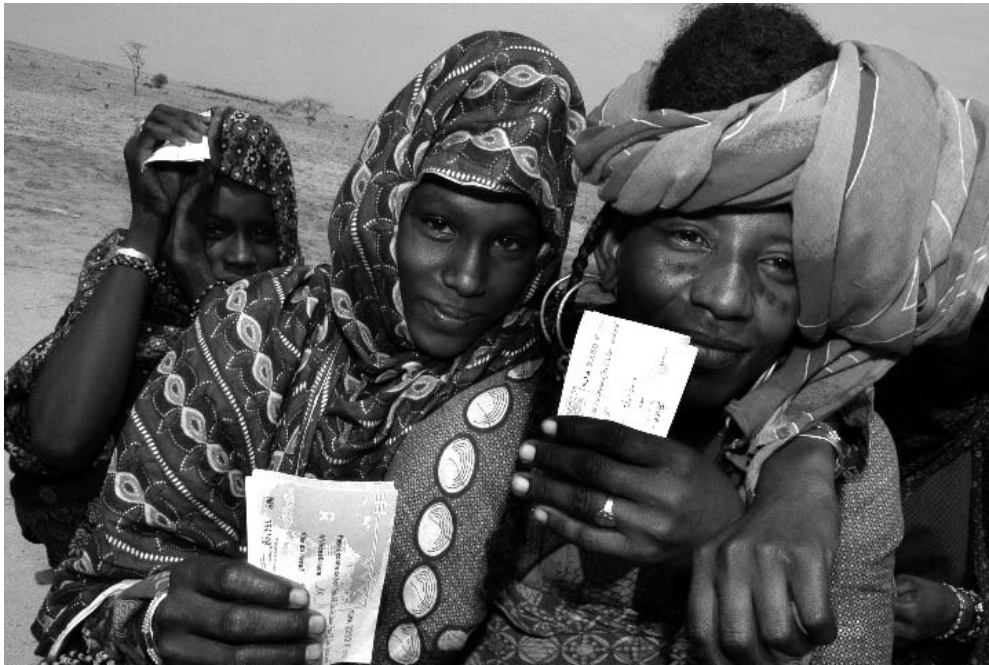
Vouchers for food in Niger, a new approach to relief.