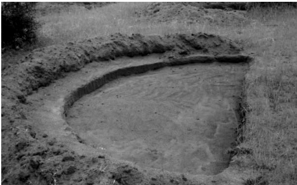
Half-moons, Niger.

Aid agencies, like Oxfam, working in Niger, have pioneered new responses to drought – such as calls for less foreign food aid and more direct transfers of cash vouchers into people’s hands to enable them to buy the local food that is available on the markets. To help in the long term agencies are working with local non-governmental organisations like JEMED, a partner of Tearfund, to trap rainfall and boost agriculture. Simple structures that capture rainwater – stone lines or earthen half-moon crescents, mini-dams and dykes – can give communities an extra three months worth of water per year.