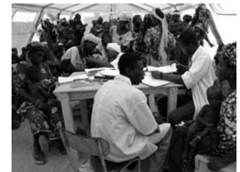
Emergency feeding, Niger, 2005.

Another factor is the developed world's failure to deliver aid predictably and in accordance with its commitments. Sahelian countries receive far less aid than other African countries affected by food crises. Annual aid to Niger, one of the world's poorest countries, actually fell from $60 per person in 1984, to $44.2 per person in 1992, $28.7 in 1998 and finally to a mere $12 per person in 2004. The UN has recommended that countries get $45 per head in order to have a chance of reaching the UN Millennium Goals by 2015. 15